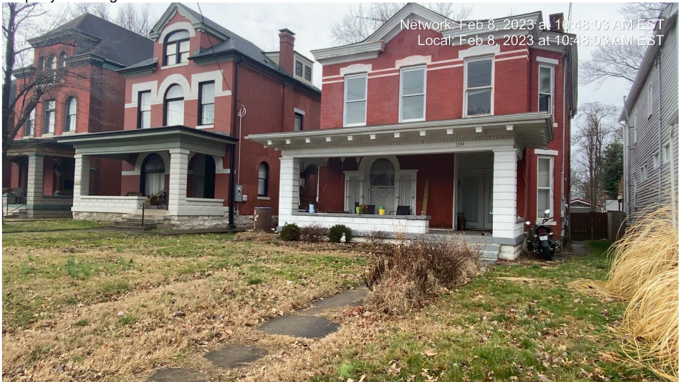
Property to the left.