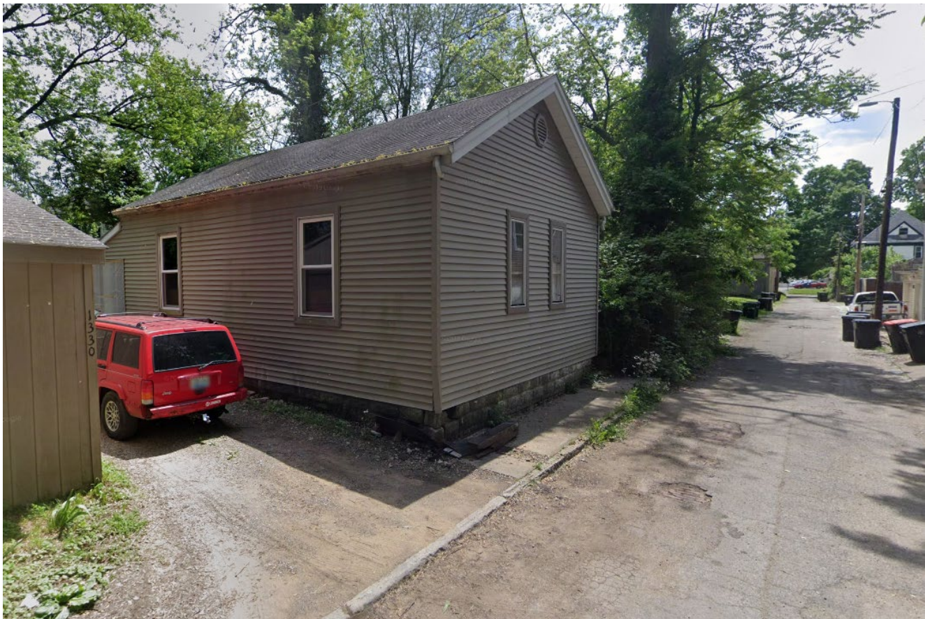
Carriage house off rear alley, Google 2019.