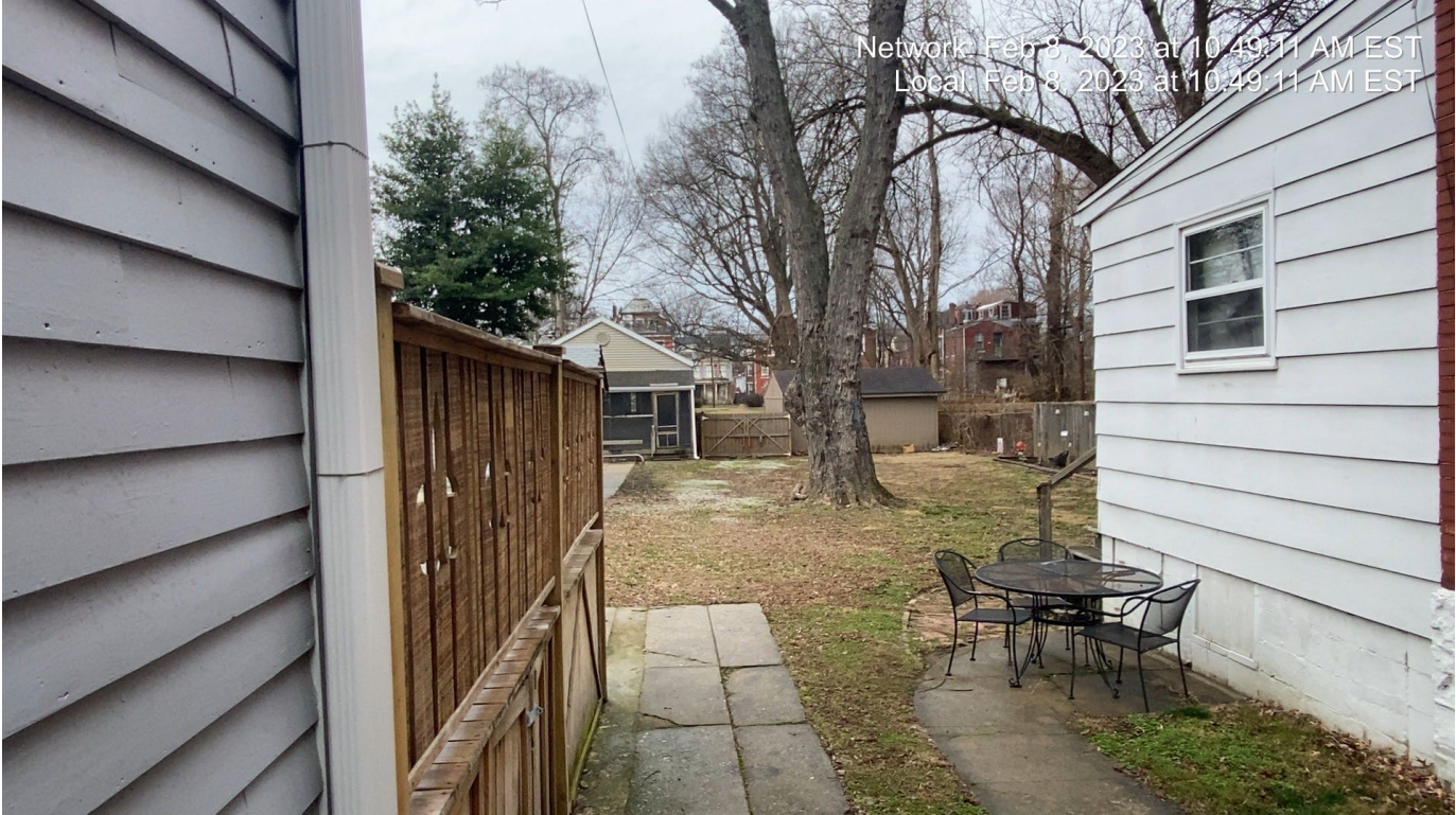
View of carriage house from front.