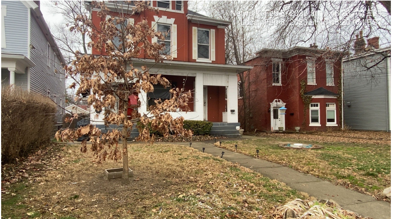
Property to the right.