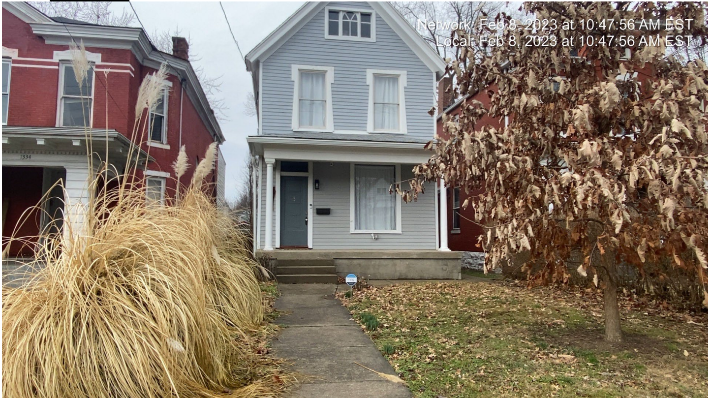
Front of subject property.