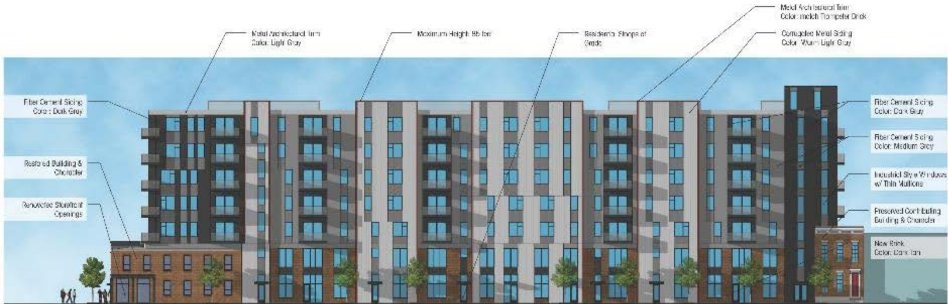
PROPOSED WASHINGTON STREET ELEVATION