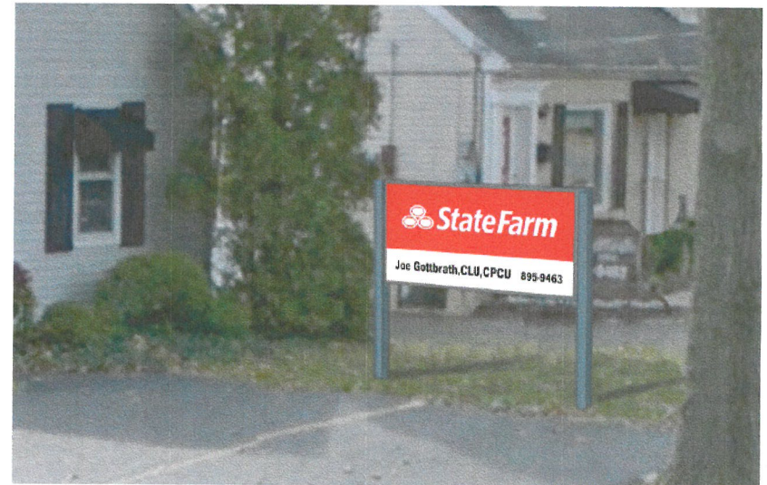
CLOSE UP AFTER

D/F ILLUMINATED BETWEEN POLE CABINET SIGN