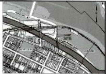
LOCATION MAP N.T.S.

THE FINAL DESIGN OF THIS PROJECT MUST MEET ALL APPLICABLE APCD REGULATIONS AND ALL APPLICABLE LOCAL, STATE AND FEDERAL REGULATIONS.