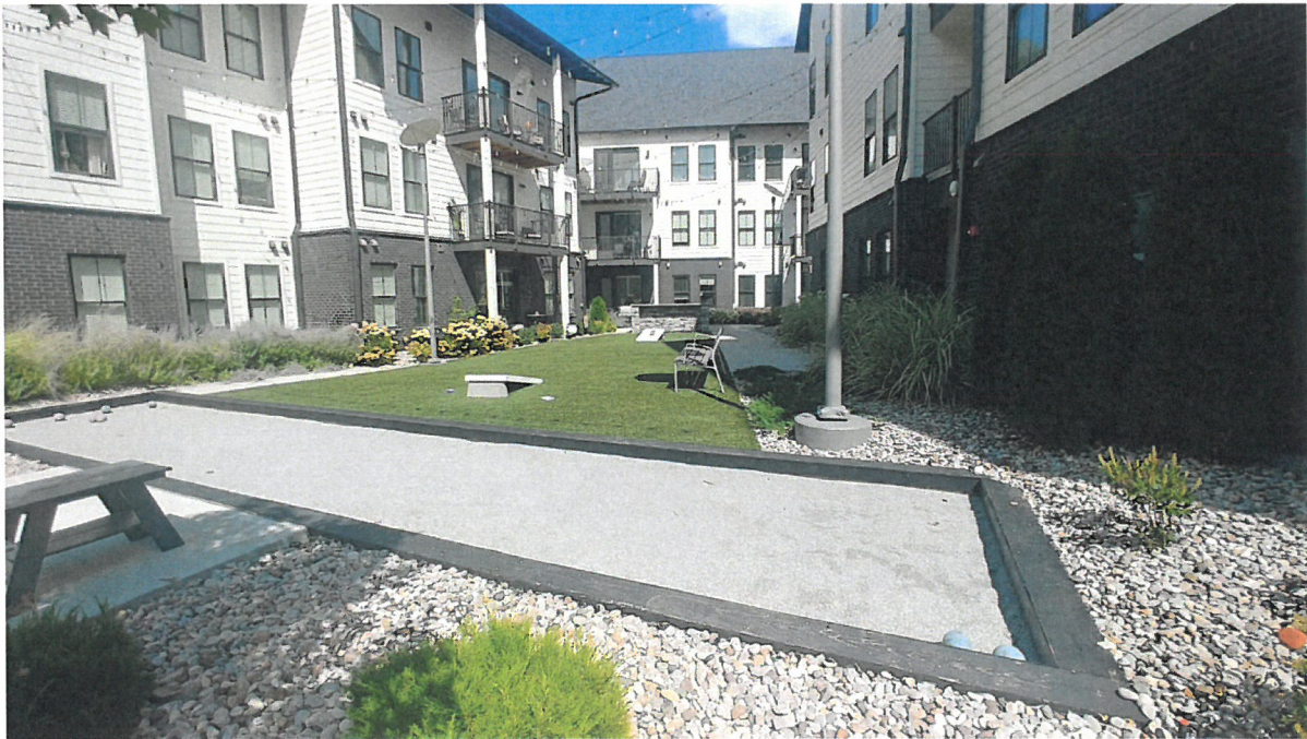
Amenities - Games

RECEIVED SEP 12 2022 PLANNING & DESIGN SERVICES 22-DDP-0081