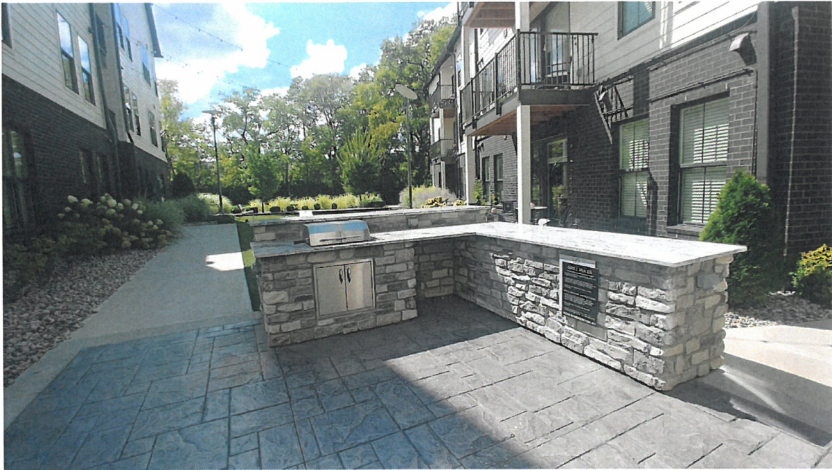
Amenities – Outdoor Kitchen