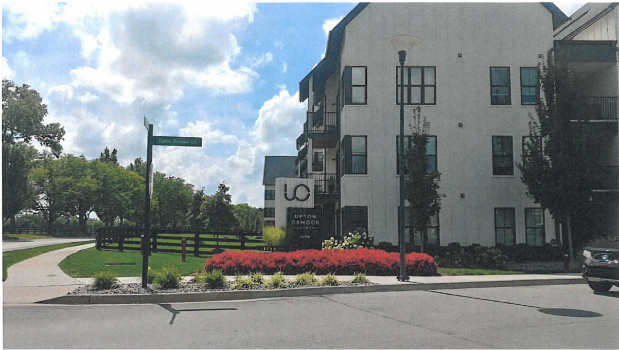
Signage and lighting