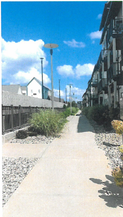
Lighting, Pedestrian Circulation