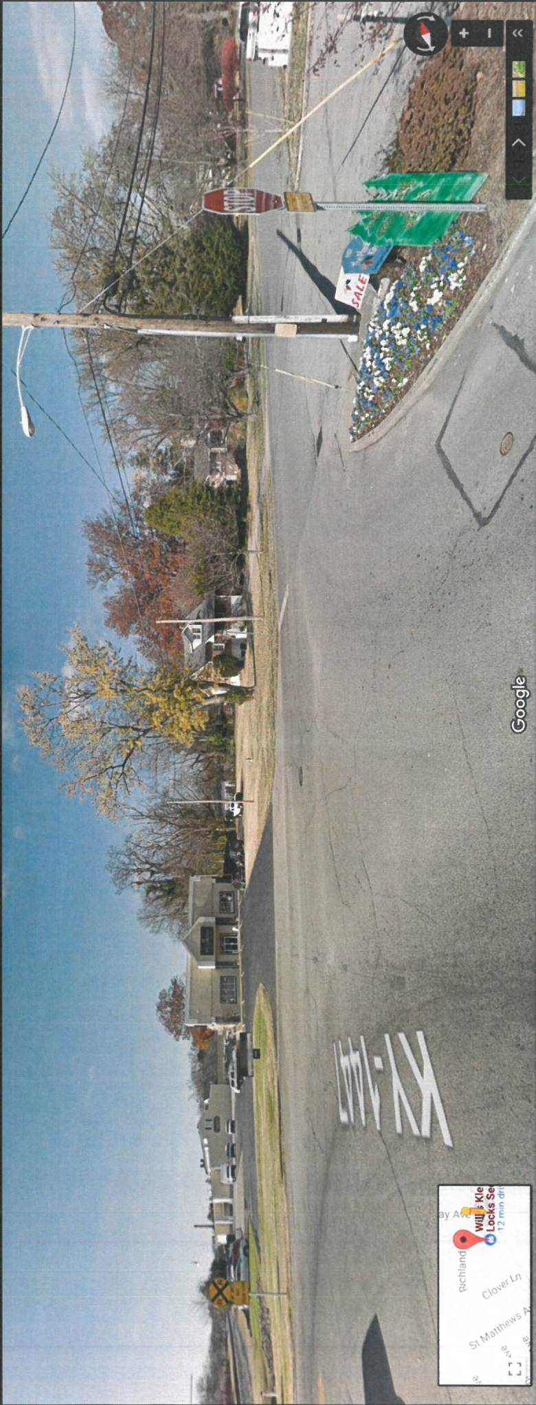
View of site looking west from the intersection of Westport Road and Ridgeway Ave.