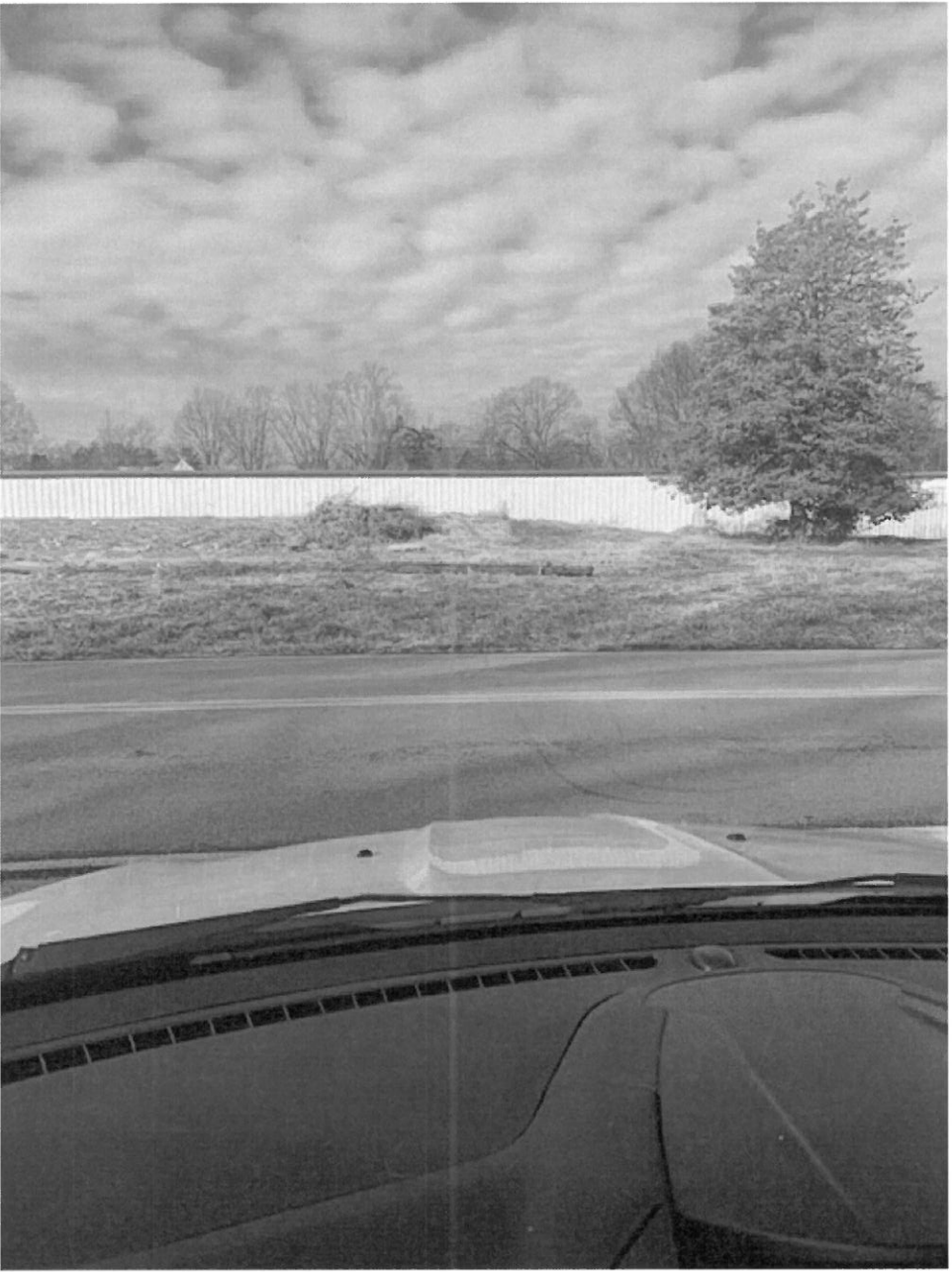
Sent from my iPhone