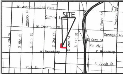
VICINITY MAP Scale: 1" = 1,500'