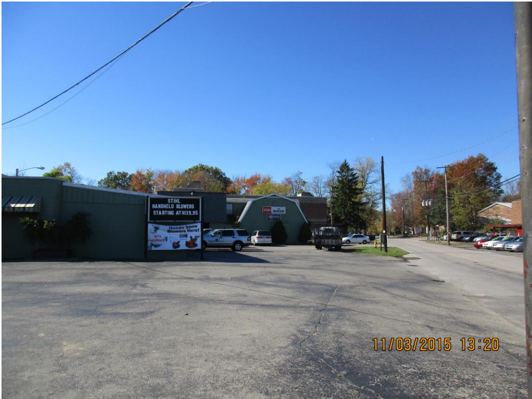
Repair shop fronting Minor Lanes behind retail store