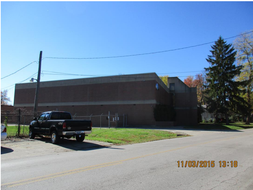
Adjacent AT&T structure