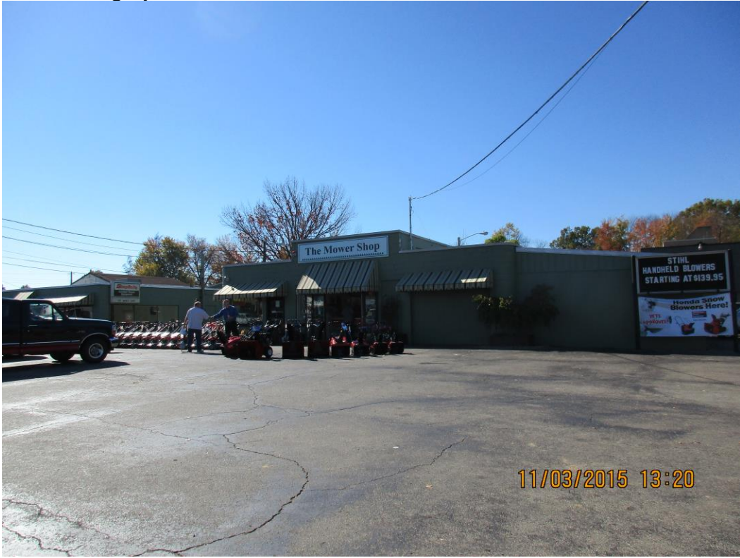
Front of the Mower Shop (Preston Highway)