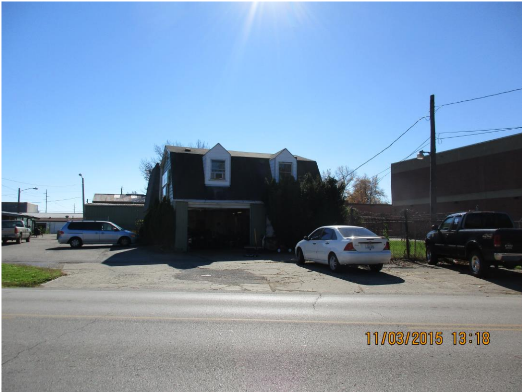
Existing building to be removed