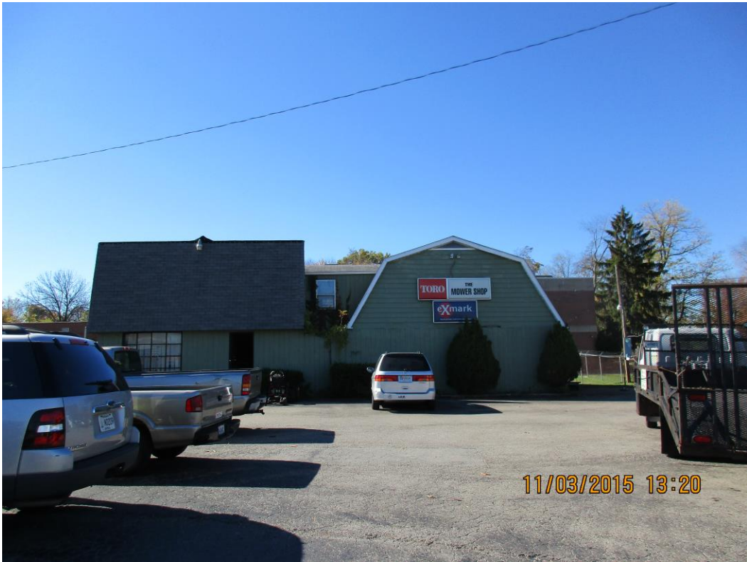
Existing building to be removed