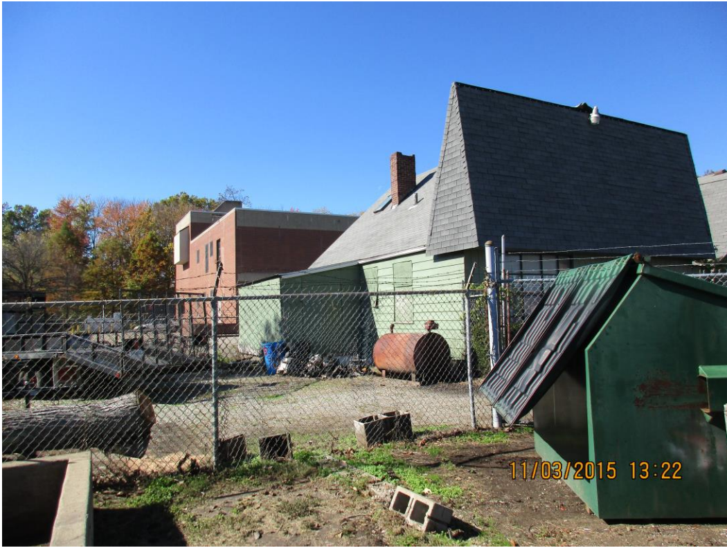
Rear of the building to be removed