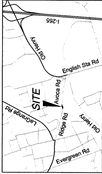
Vicinity Map 1" = 4000'

Louisville & Jefferson County Metro Government (Berrytown Park) 1300 Heafer Road