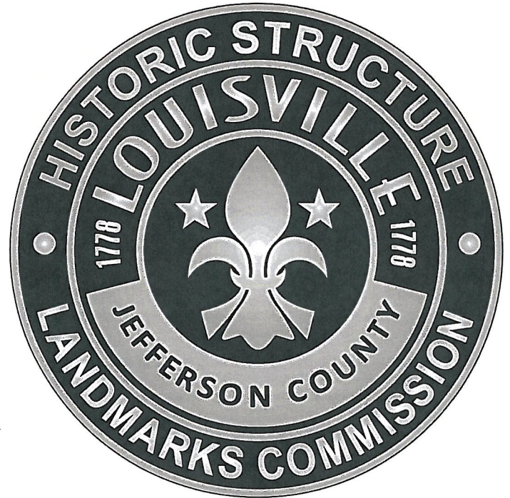
Black and Sand