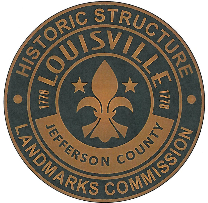
Black and Gold