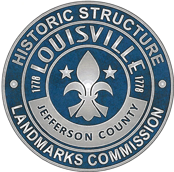
Blue and Sand