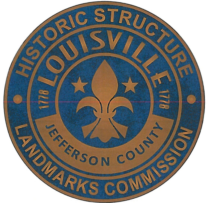
Blue and Gold