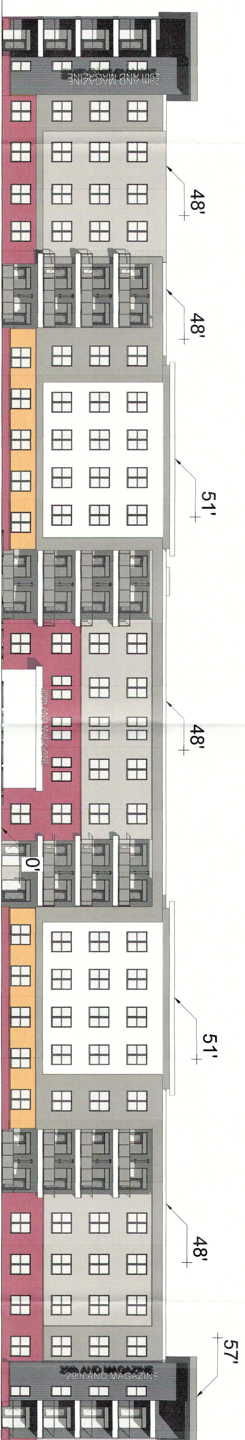
1 29th Street Elevation SD2.102 1/16" = 1'-0"