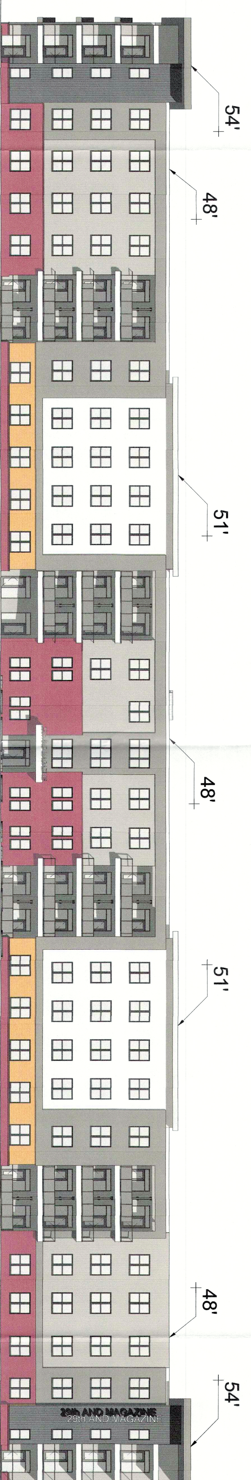
3 30th Street Elevation SD2.102 1/16" = 1'-0"