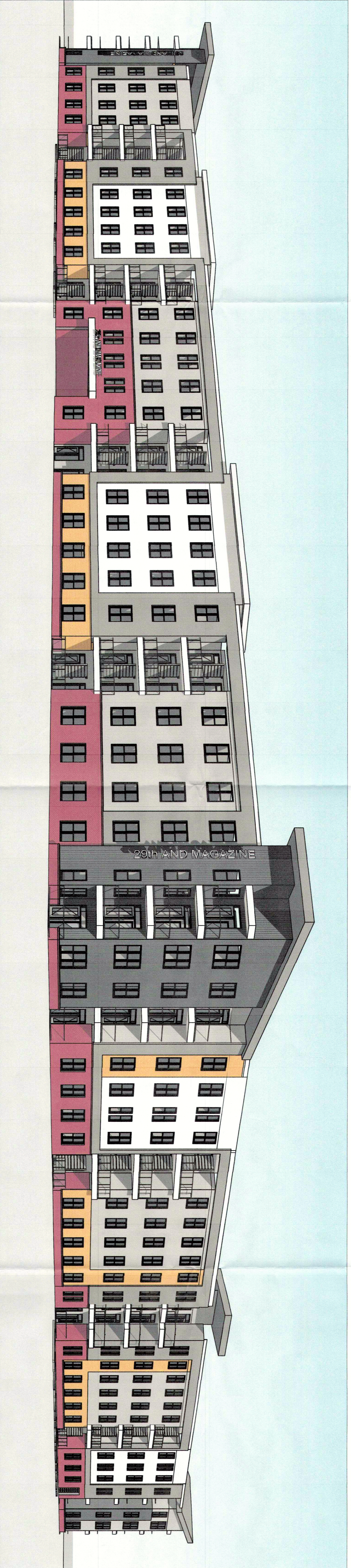
1 Perspective View SD2.101

RECEIVED JUN 29 2020 PLANNING & DESIGN SERVICES