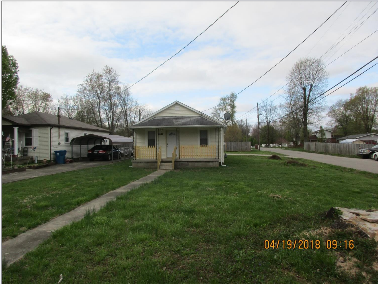
The front of the subject property.