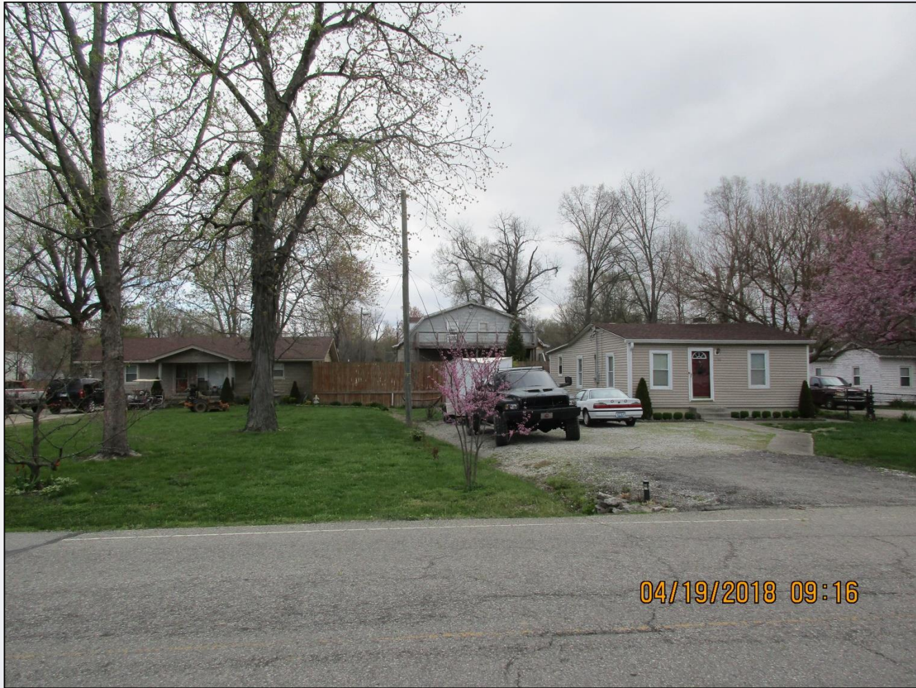
The properties across Sylvania Road.