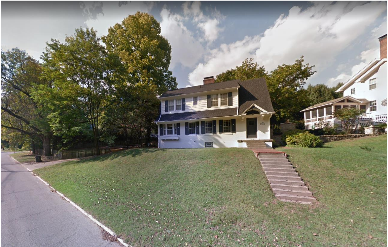
Front of subject site