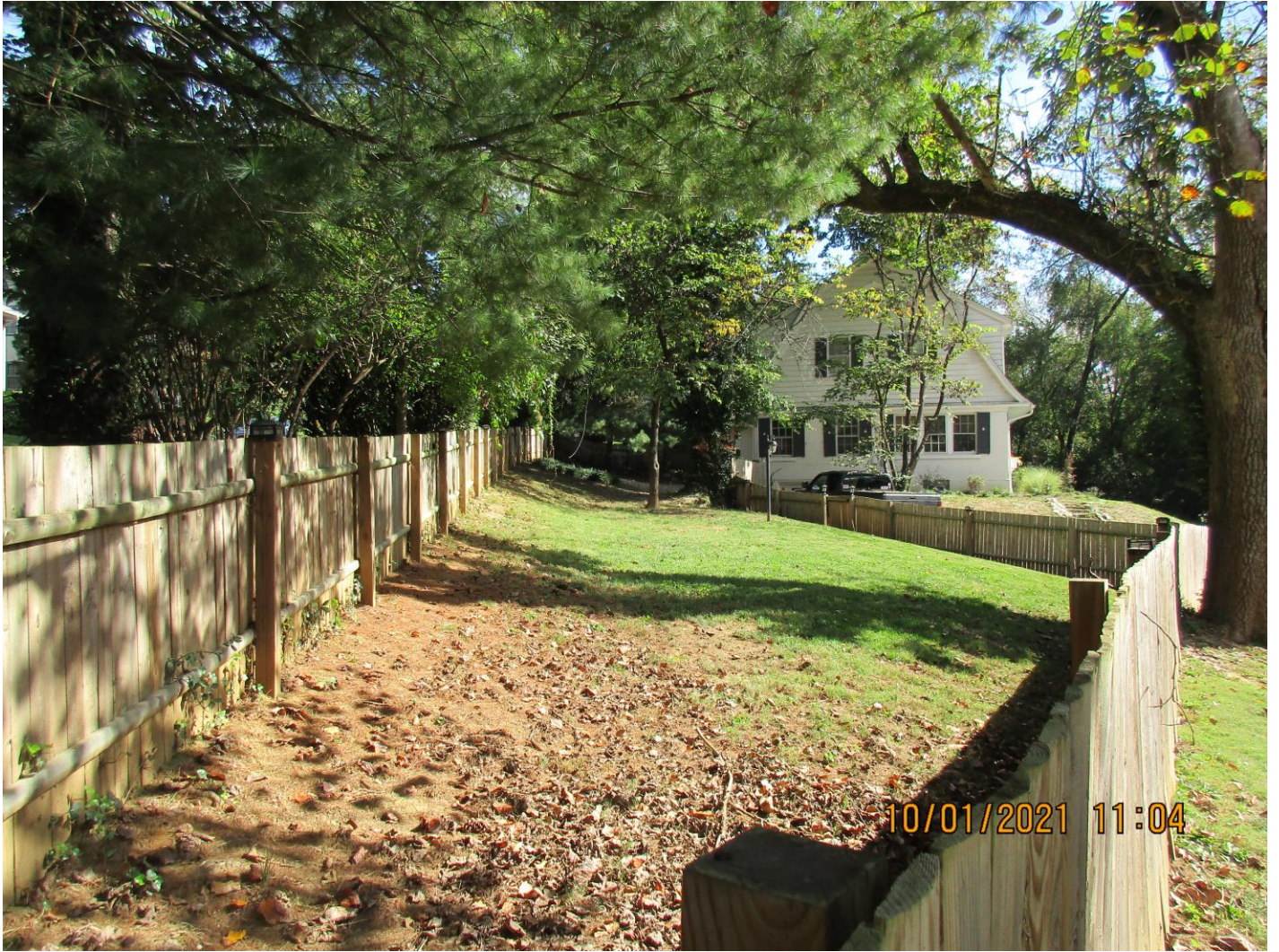
View of subject property from intersection of Rosewood Ave and Castlewood Ave.