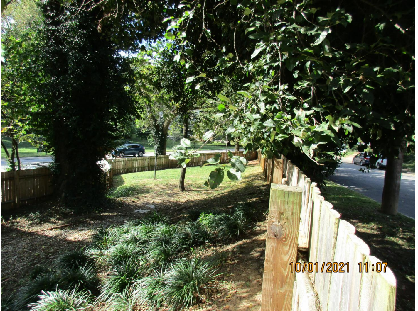
View of open space from variance area.