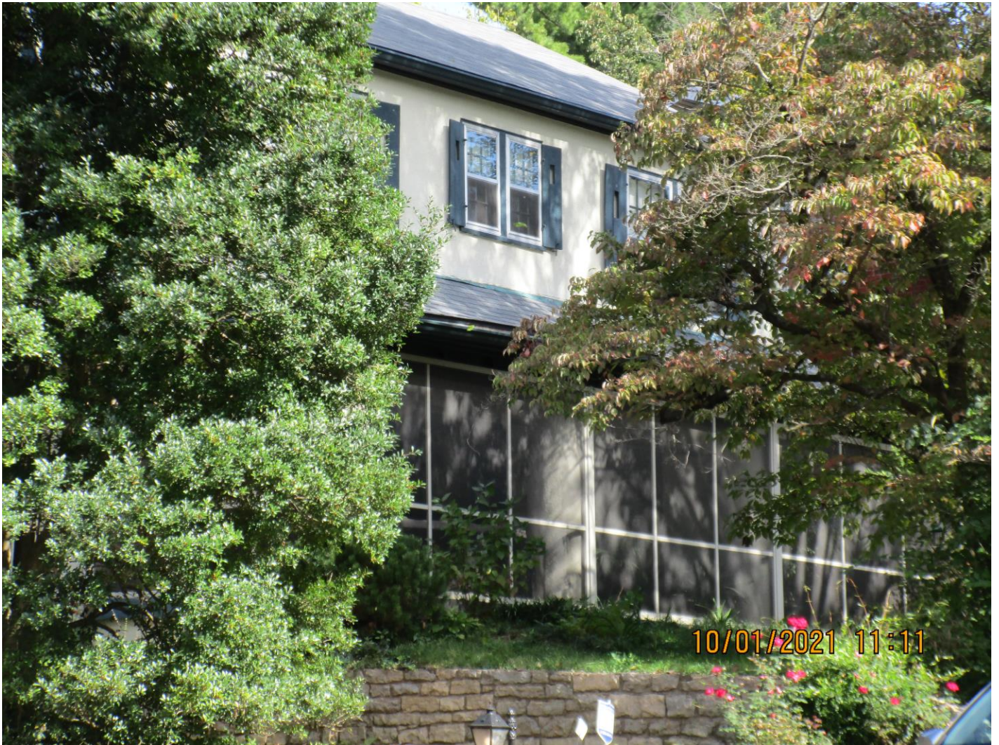
Across Rosewood Ave.