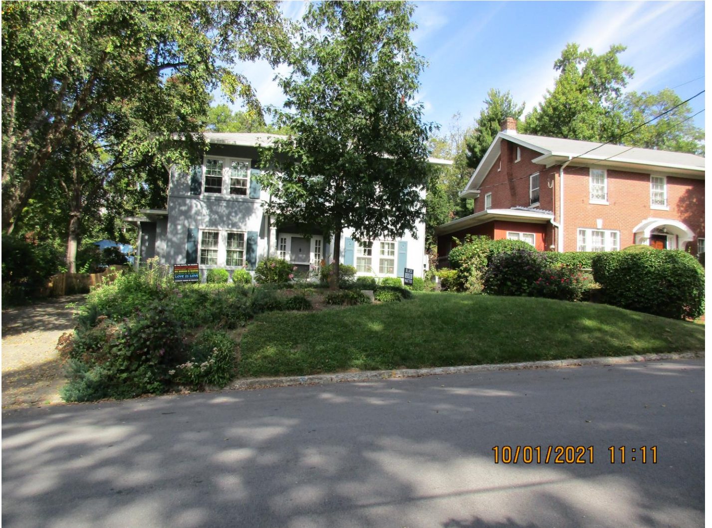
Across Rosewood Ave.