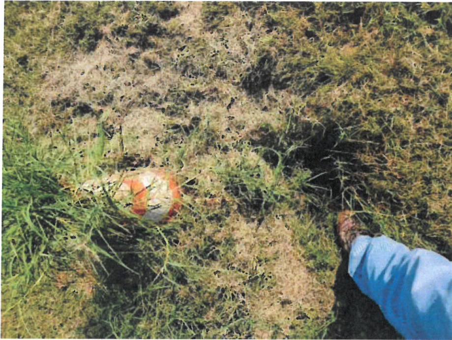
Sinkhole present in Ballfield