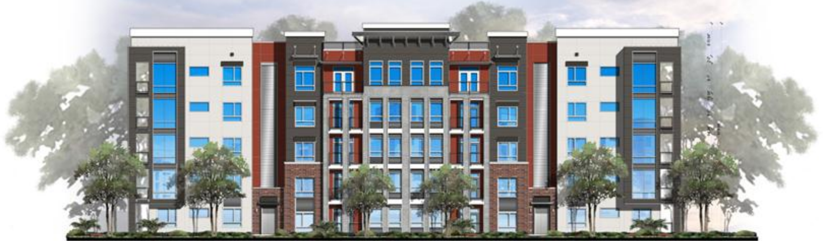
BUILDING A - NORTH/ SOUTH ELEVATION BUILDING B - NORTH/ SOUTH ELEVATION