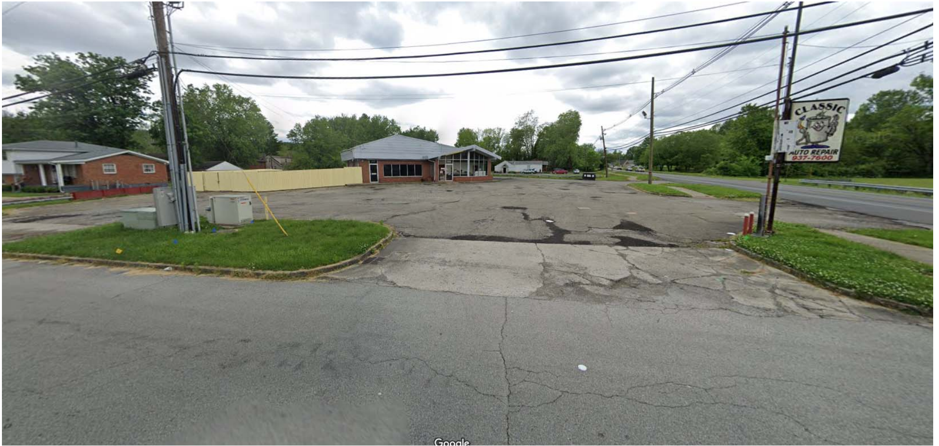
View of site from Windemere Drive.