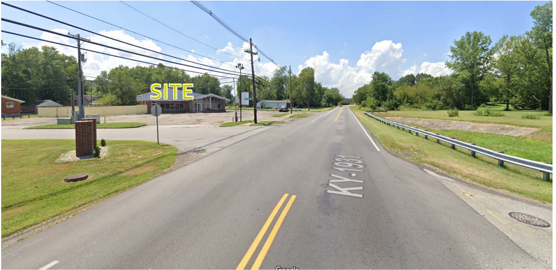
View of St. Andrews Church Road looking west. Site is to the left.