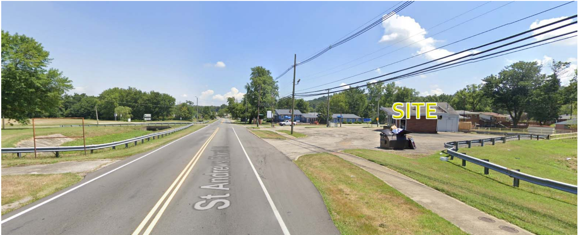
View of St. Andrews Church Road looking east. Site is to the right.