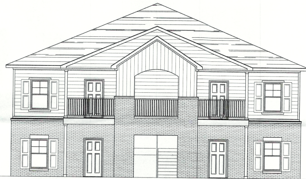
3 A1.2 2 BED, 4 UNIT BUILDING BUILDING ELEVATION Scale: 1/4" = 1'-0"