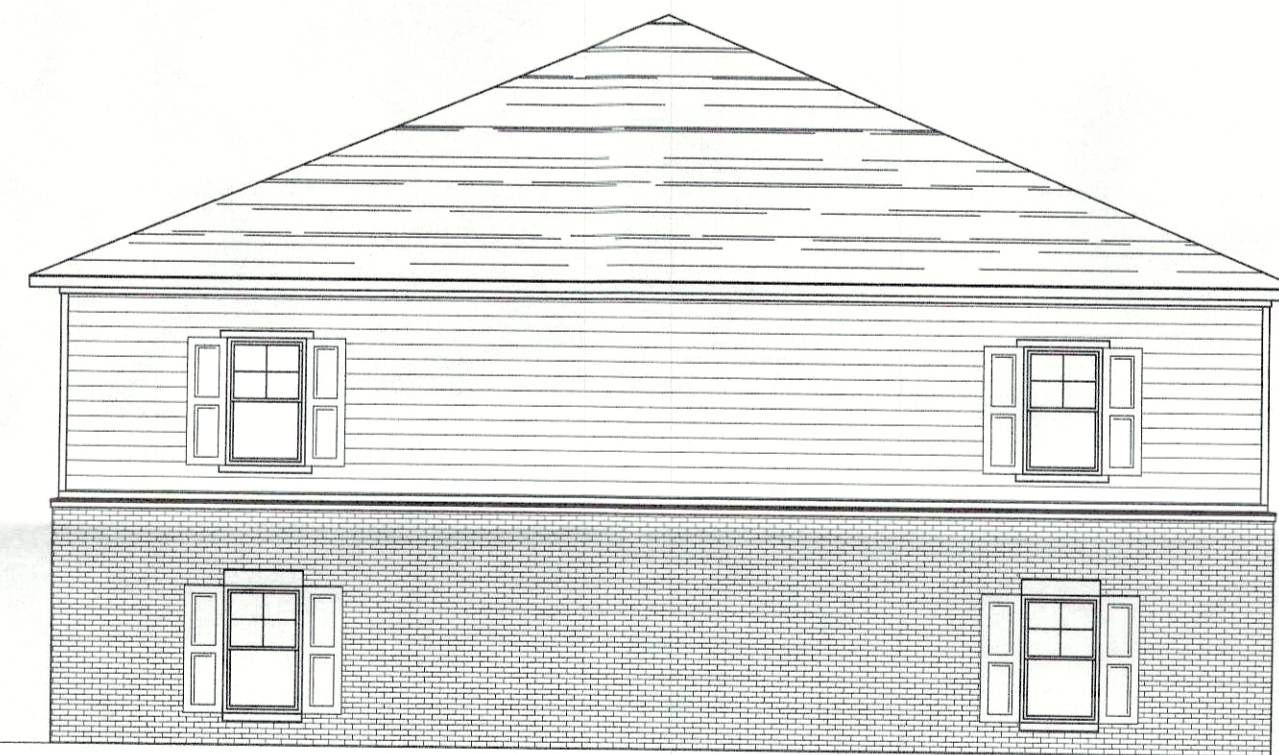
4 A1.2 2 BED, 4 UNIT BUILDING BUILDING ELEVATION Scale: 1/4" = 1'-0"