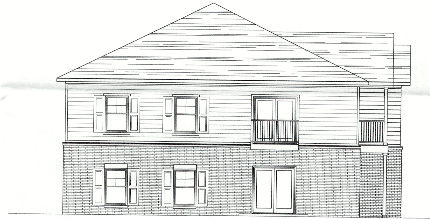
2 A1.2 2 BED, 4 UNIT BUILDING BUILDING ELEVATION Scale: 1/4" = 1'-0"