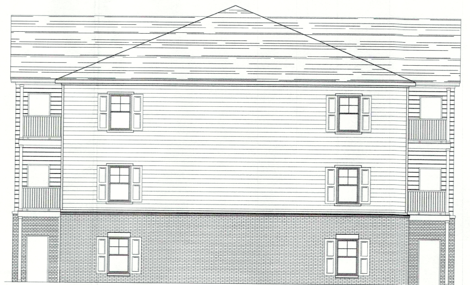
2 A1.1 2 BED REGULAR BUILDING ELEVATION Scale: 1/4" = 1'-0"