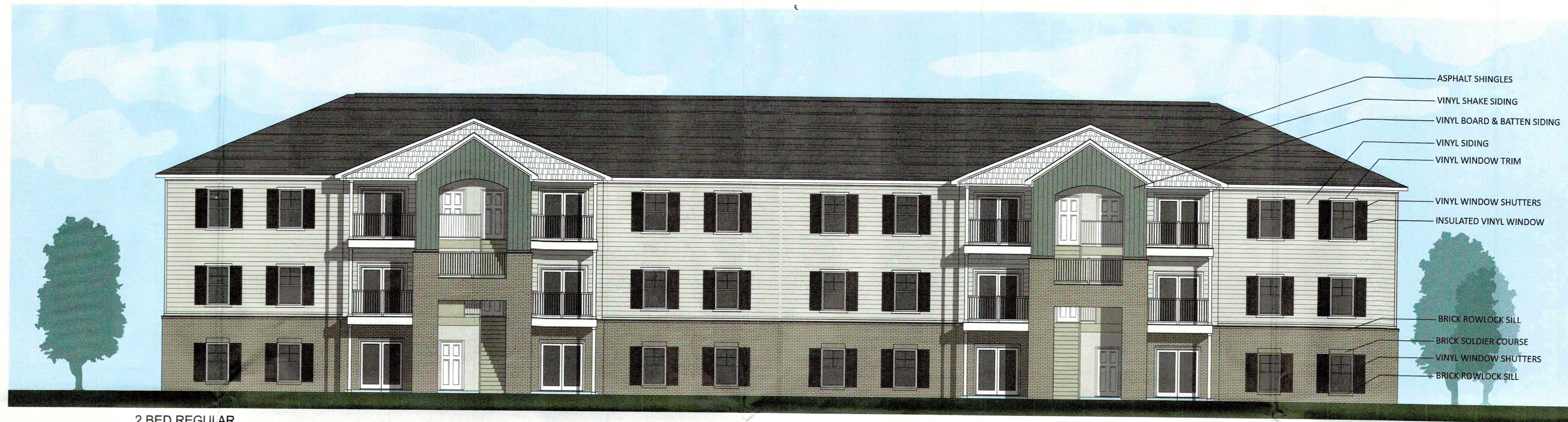
1 A1.1 2 BED REGULAR BUILDING ELEVATION Scale: 1/4" = 1'-0"