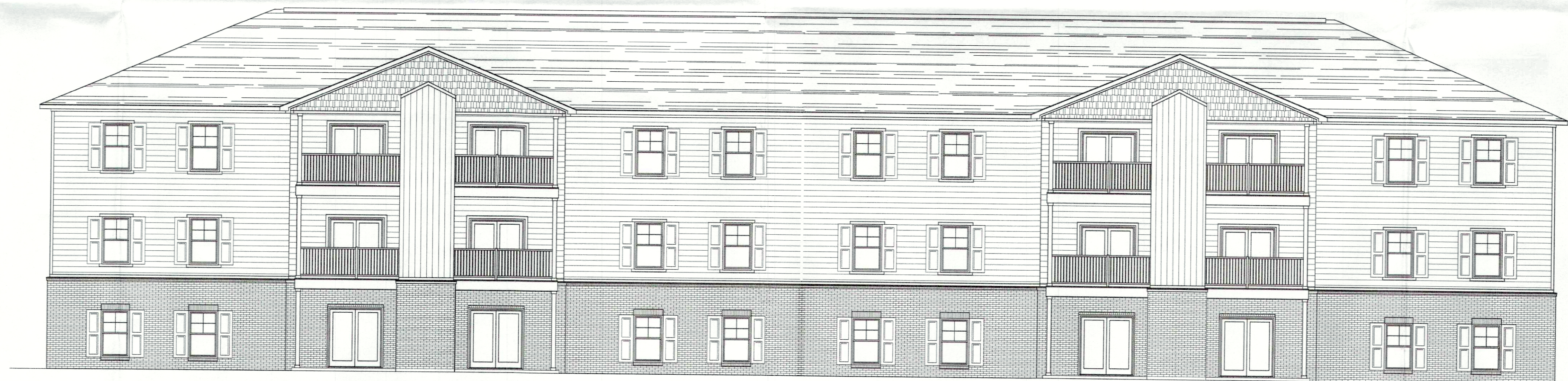
4 A1.1 2 BED REGULAR BUILDING ELEVATION Scale: 1/4" = 1'-0"