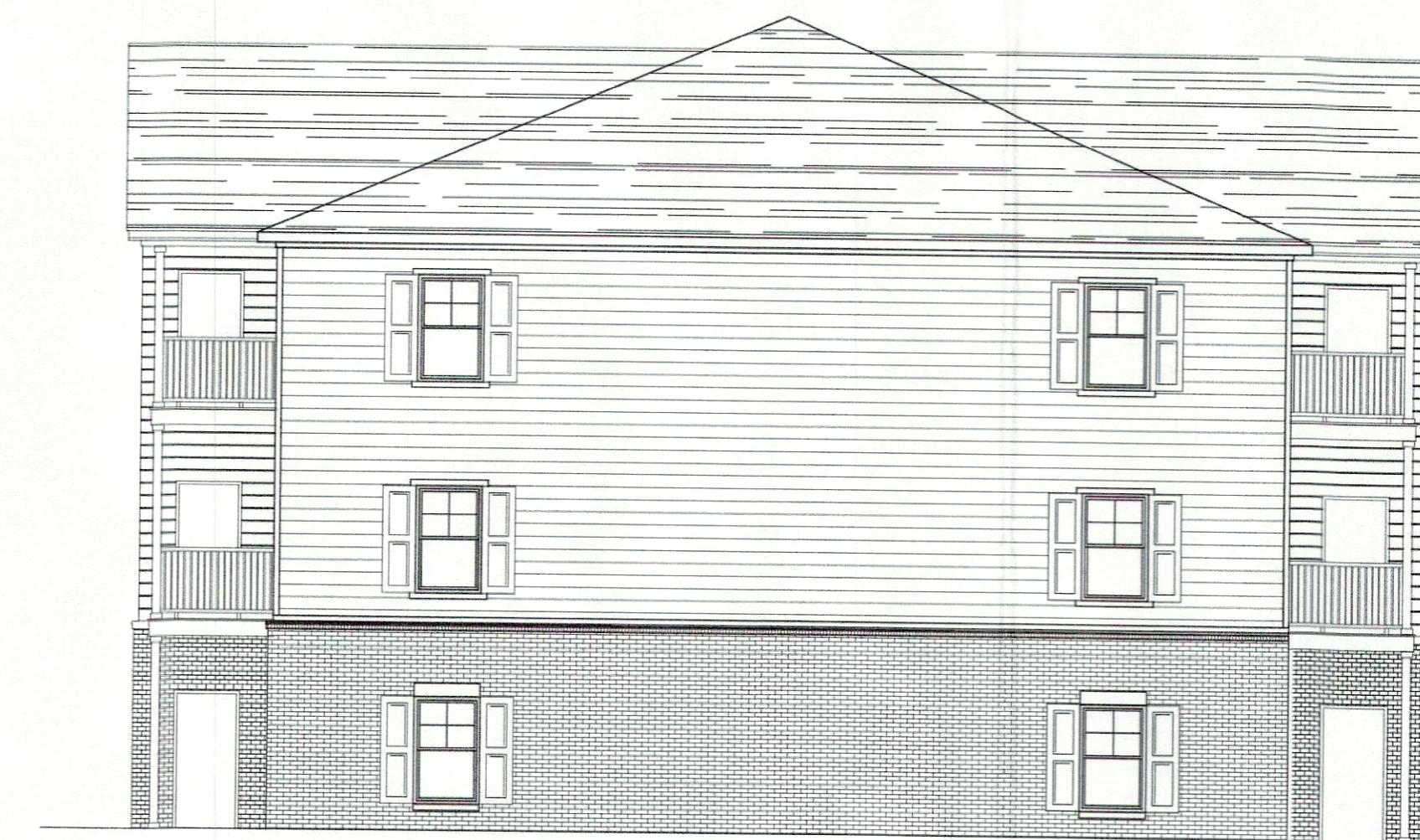
3 A1.1 2 BED REGULAR BUILDING ELEVATION Scale: 1/4" = 1'-0"