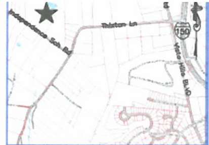
Location Map No Scale

Horizontal Datum: NAD 1983 (CONUS) Grid .Kentucky North 1601 State Plane. Vertical Datum: NAVD 1988. Lambert Conformal Conic 2 Parallel. Geoid 12BUS