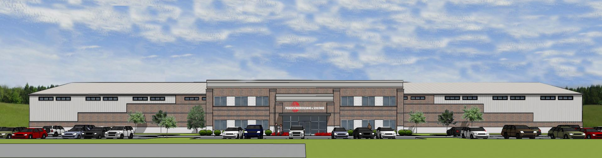
POWERSCREEN CRUSHING & SCREENING - BAYUS DESIGN WORKS WEST ELEVATION