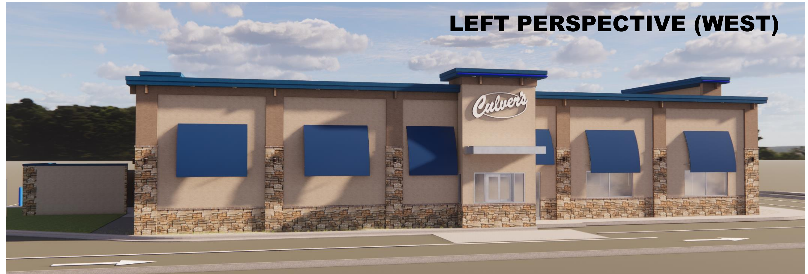
LEFT PERSPECTIVE (WEST)