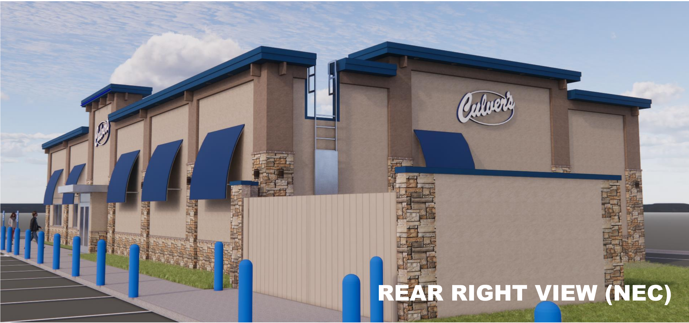
REAR RIGHT VIEW (NEC)