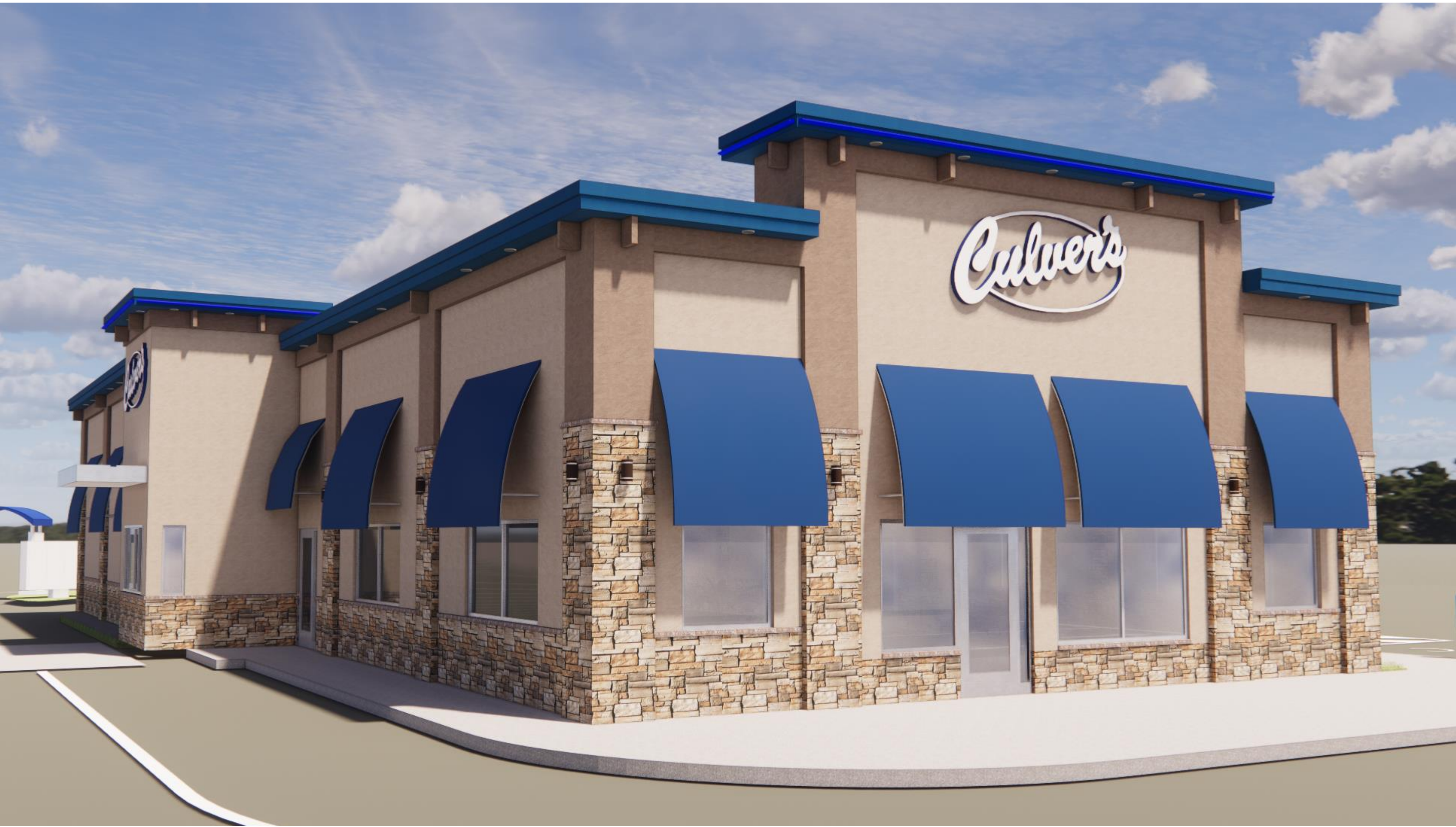
FRONT LEFT VIEW (SWC)