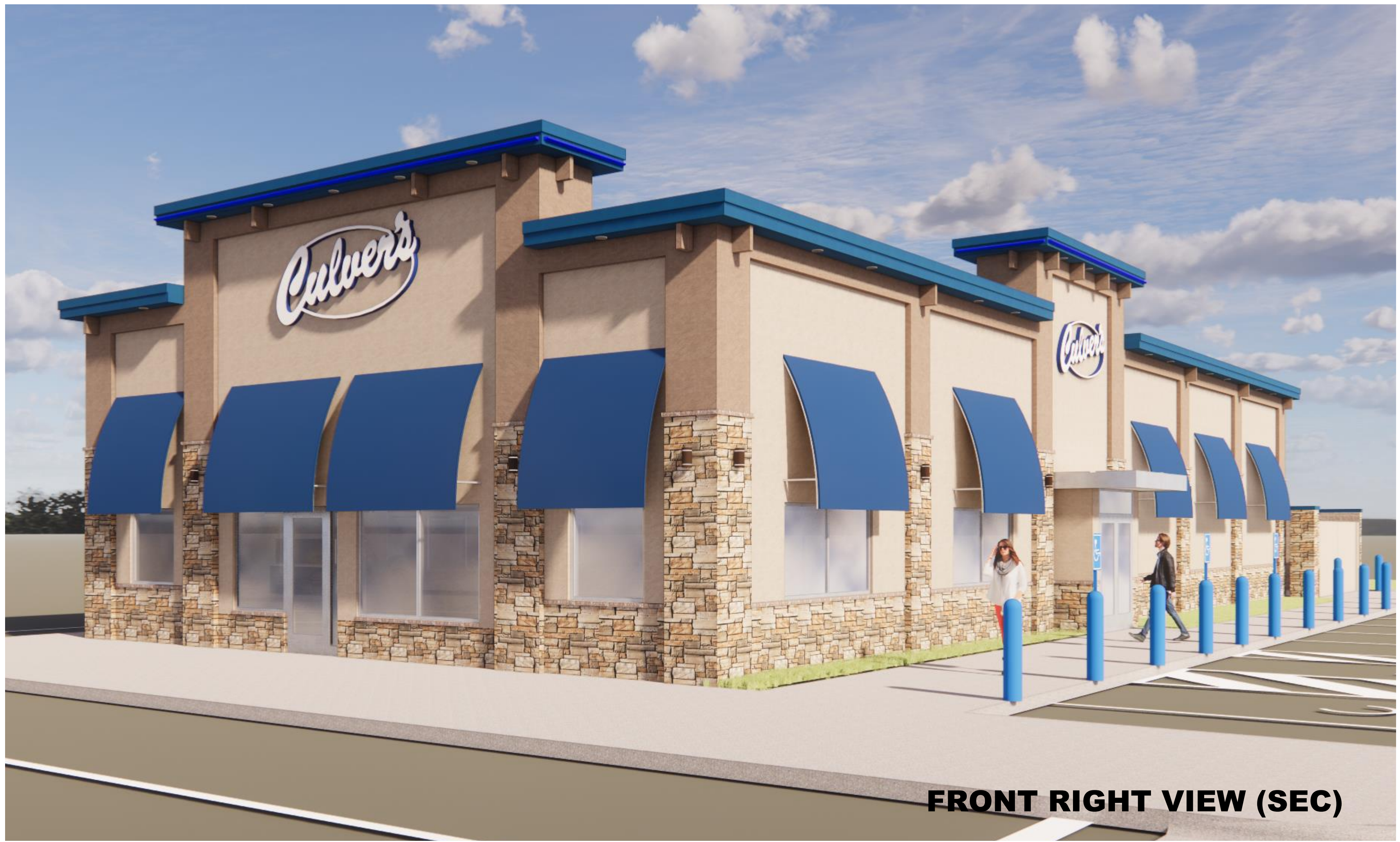
FRONT RIGHT VIEW (SEC)