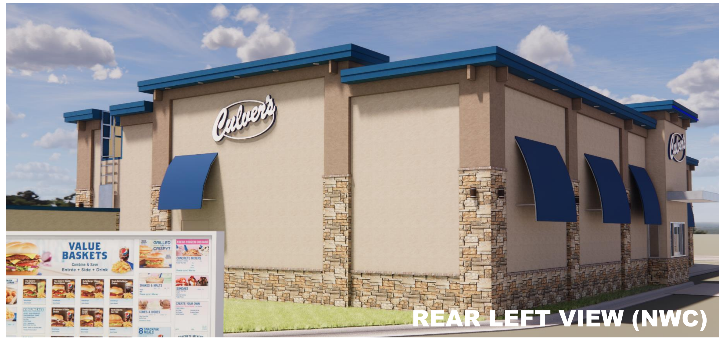
REAR LEFT VIEW (NWC)