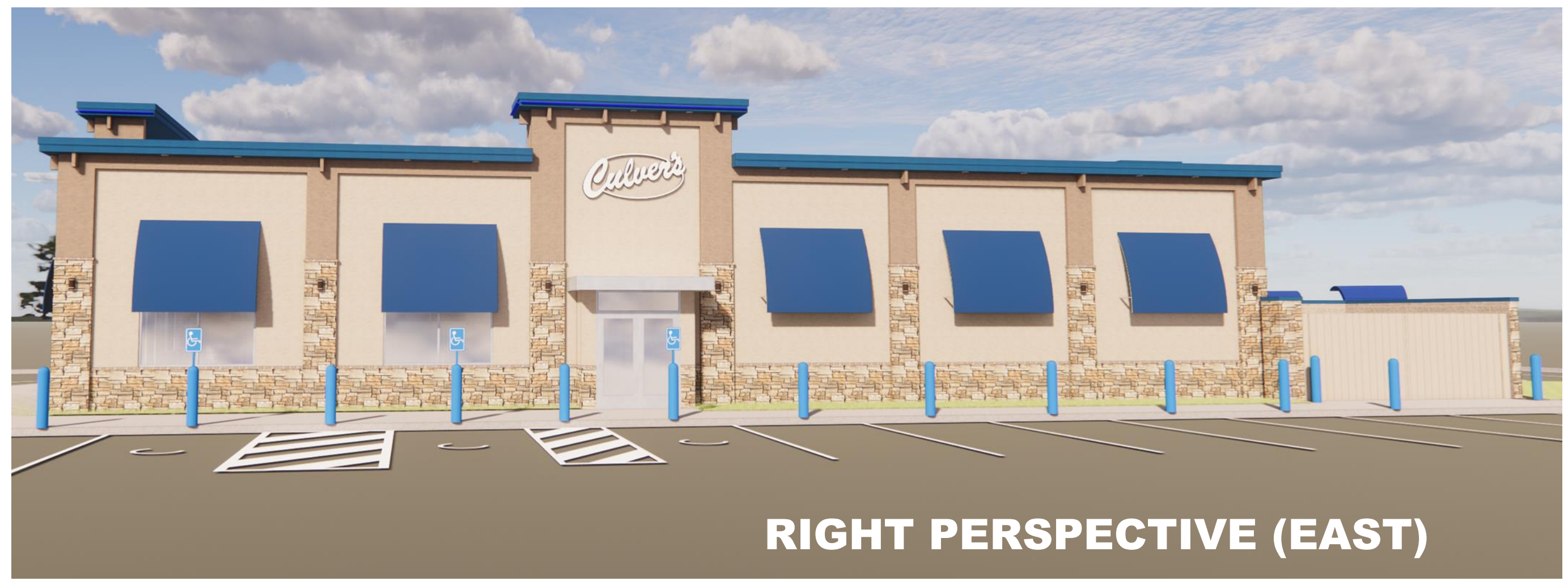
RIGHT PERSPECTIVE (EAST)