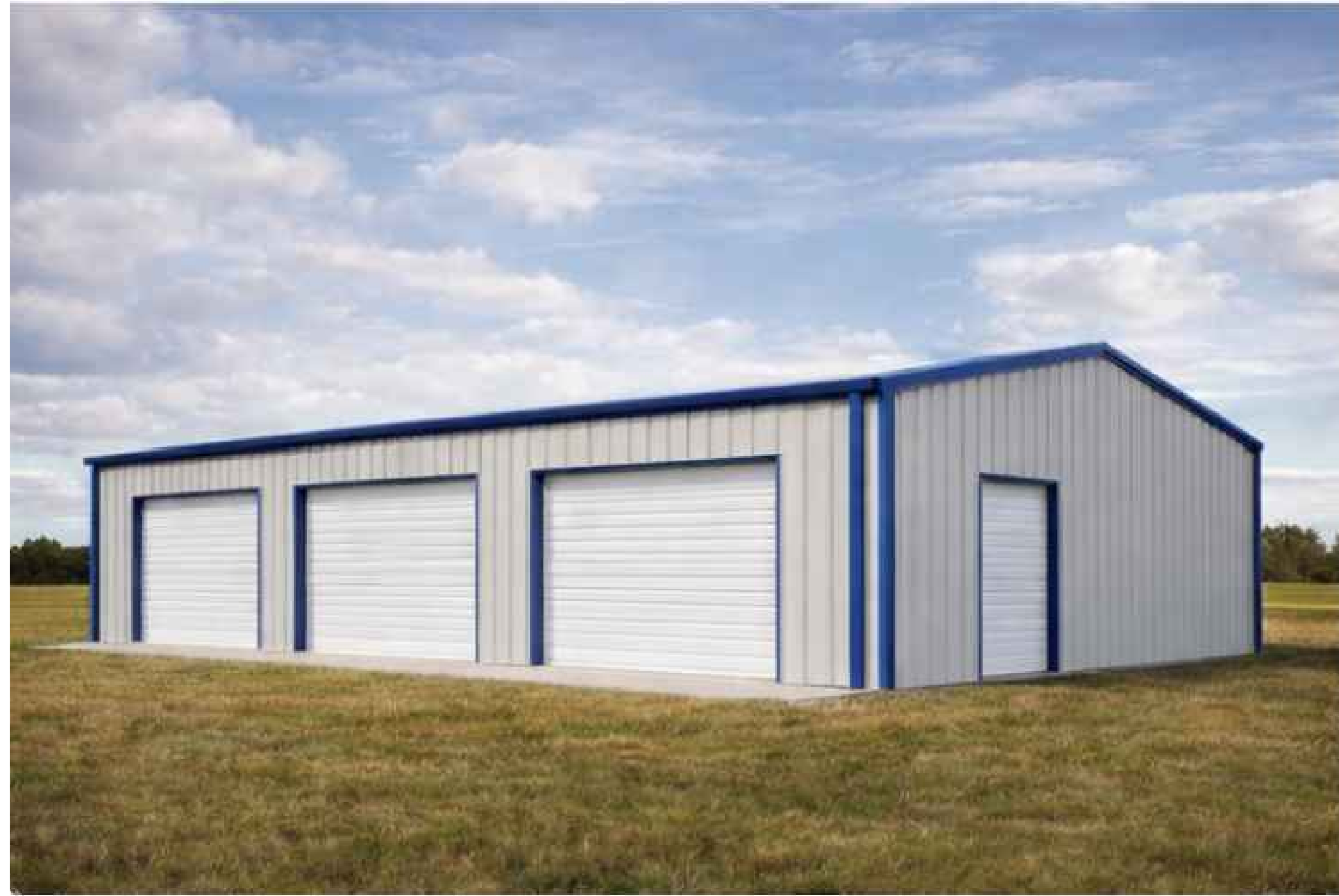
NE CORNER N.T.S