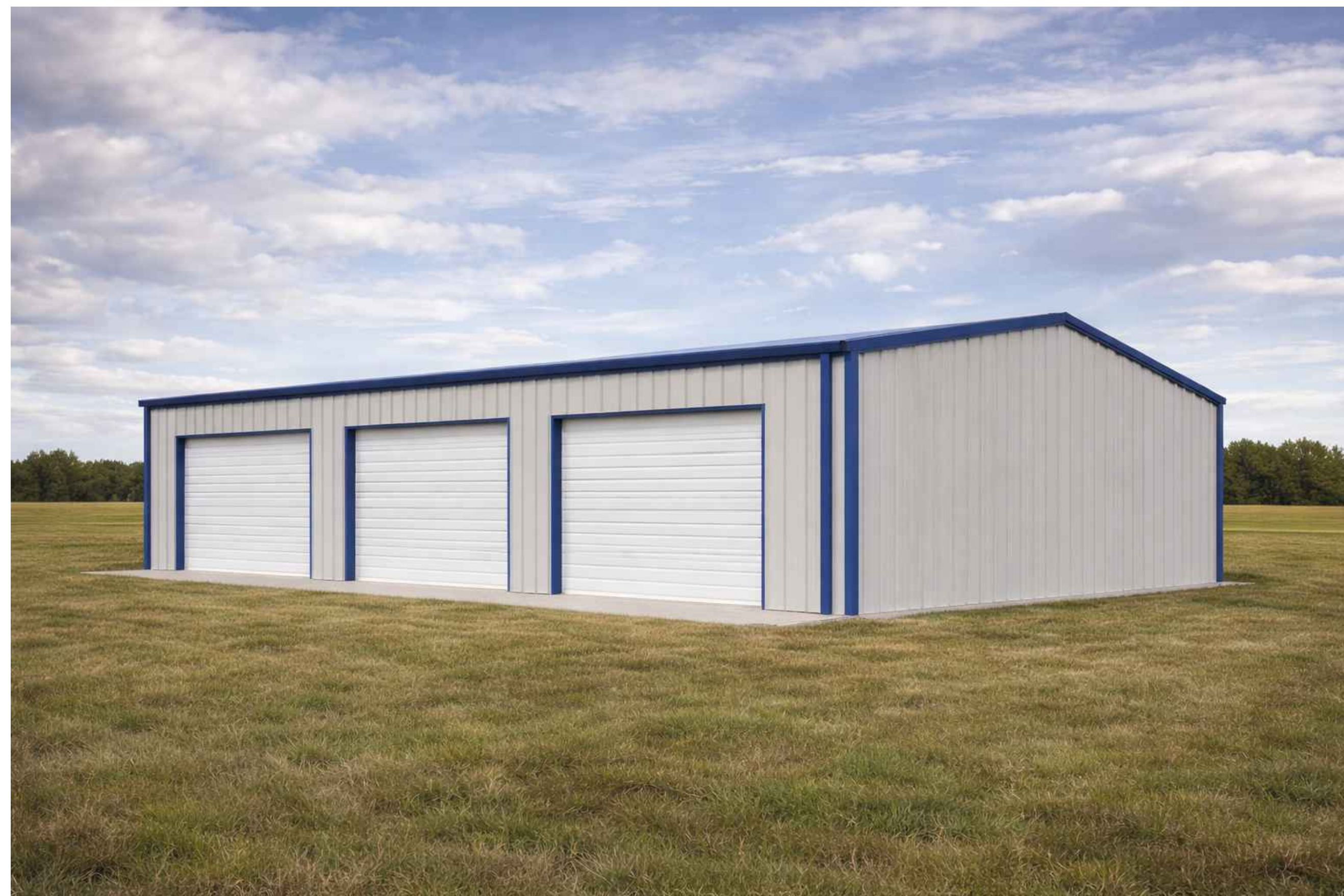
SW CORNER N.T.S