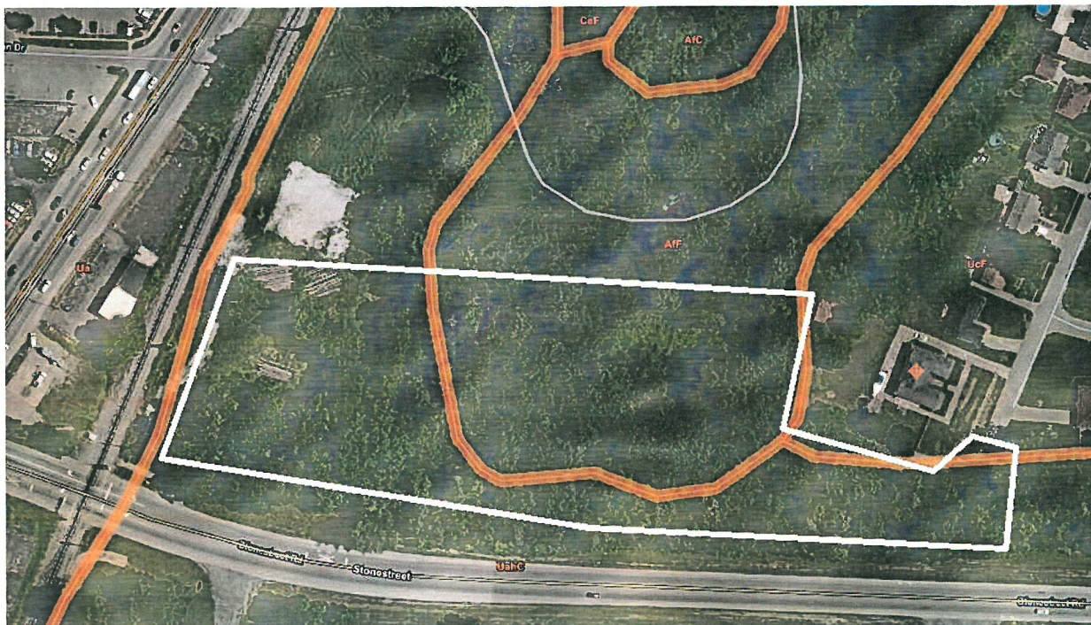
Figure 2 - Soil Data Map with Approximate Property Location

The USDA "Web Soil Survey" indicated 3 soil types for the site as shown in the Figure 2. Descriptions of these soil types are summarized below.