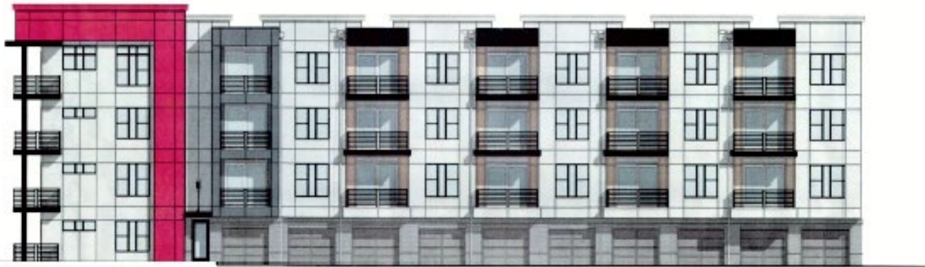
BUILDING 2 EAST ELEVATION