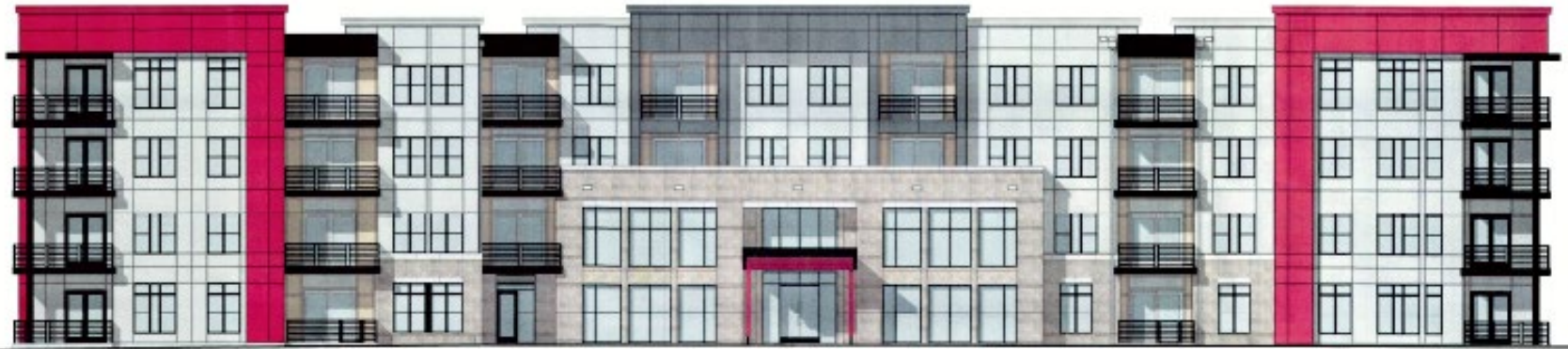
BUILDING 1 SOUTH ELEVATION