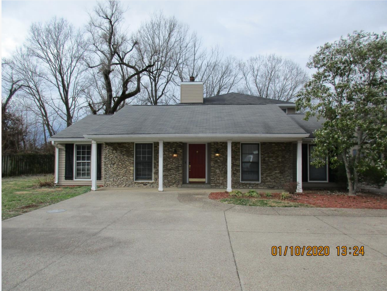
Front of subject property.