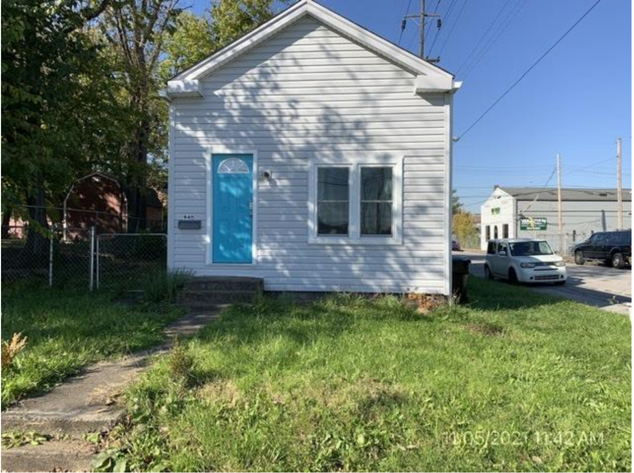
Across E. Caldwell St.