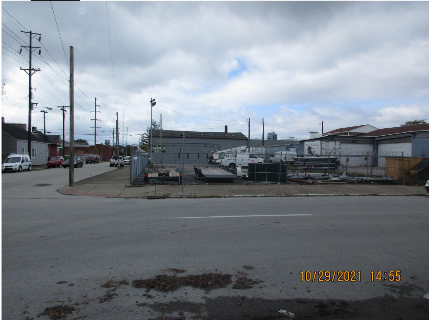
Front of subject property.