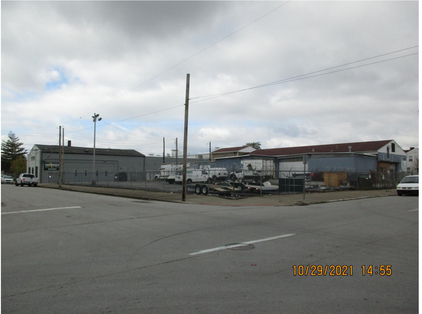
View of subject property from intersection of S. Preston and E. Caldwell St.