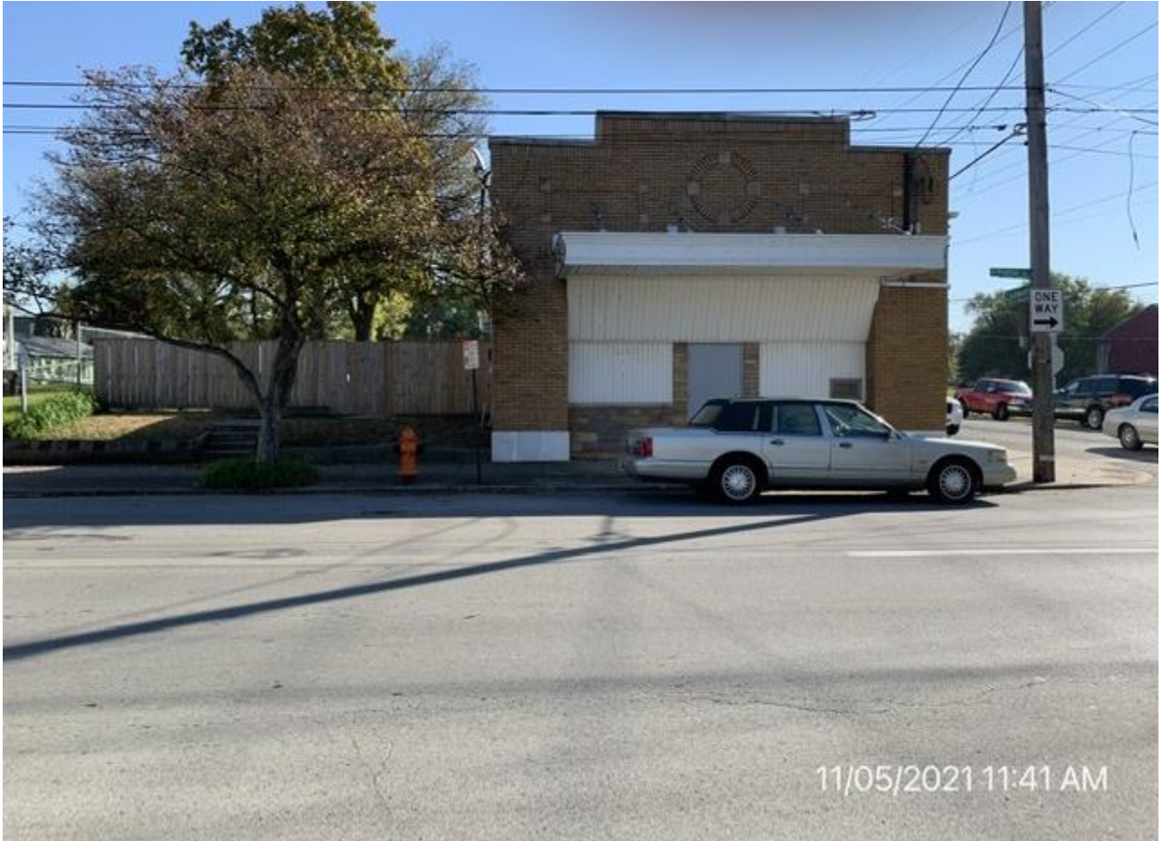
Across S. Preston St.