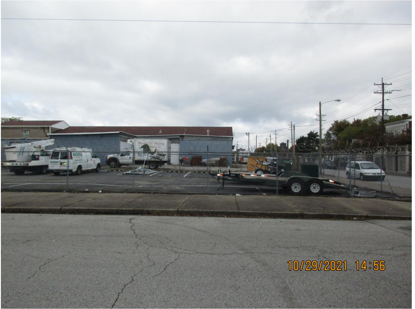
View of subject property from E. Caldwell St.