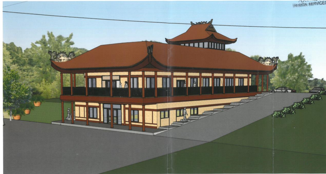
Chùa Phước Hậu