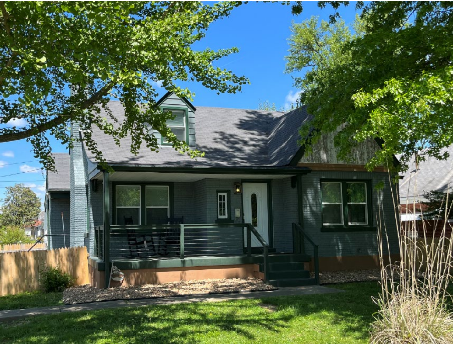
Current site photos