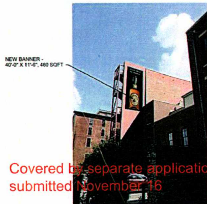
STAIR TOWER WEST WALL SIGNAGE