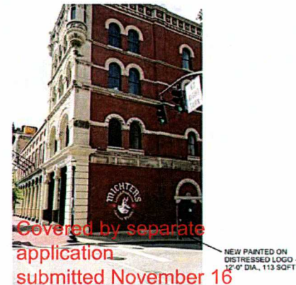
8TH STREET WALL SIGNAGE