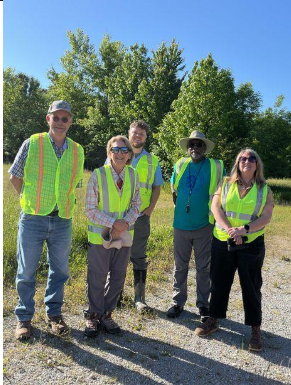
Direction (East). Description: Monitoring team photo