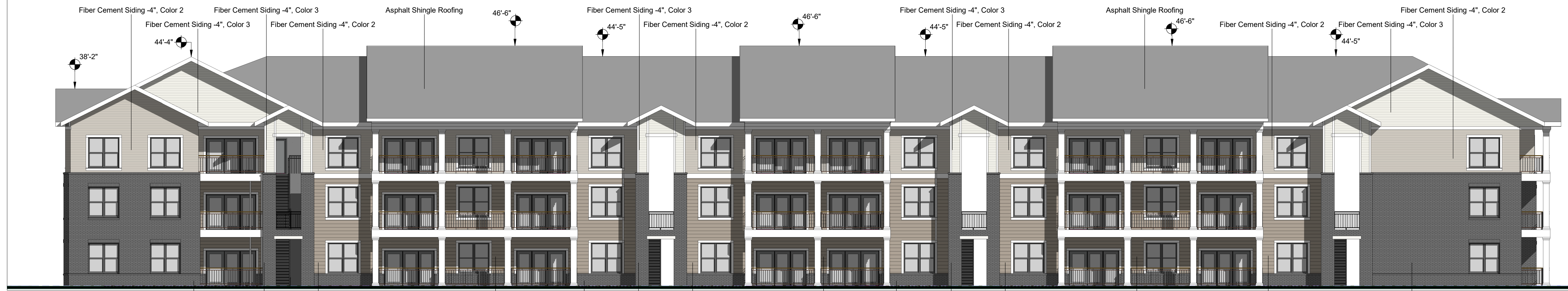
1 Schematic Elevation - North - Corner 01 SD2.101 3/32" = 1'-0"