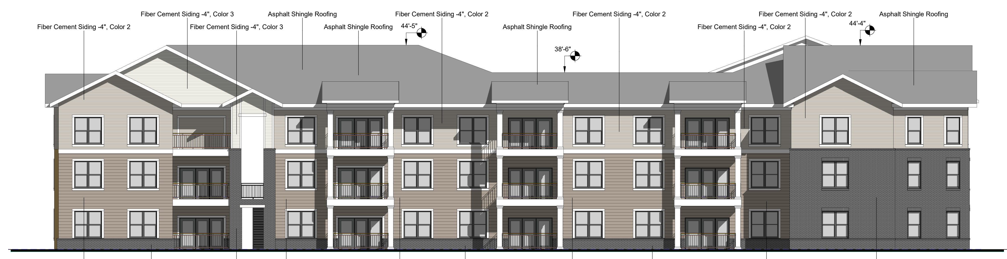
2 Schematic Elevation - East - Corner 01 SD2.101 3/32" = 1'-0"