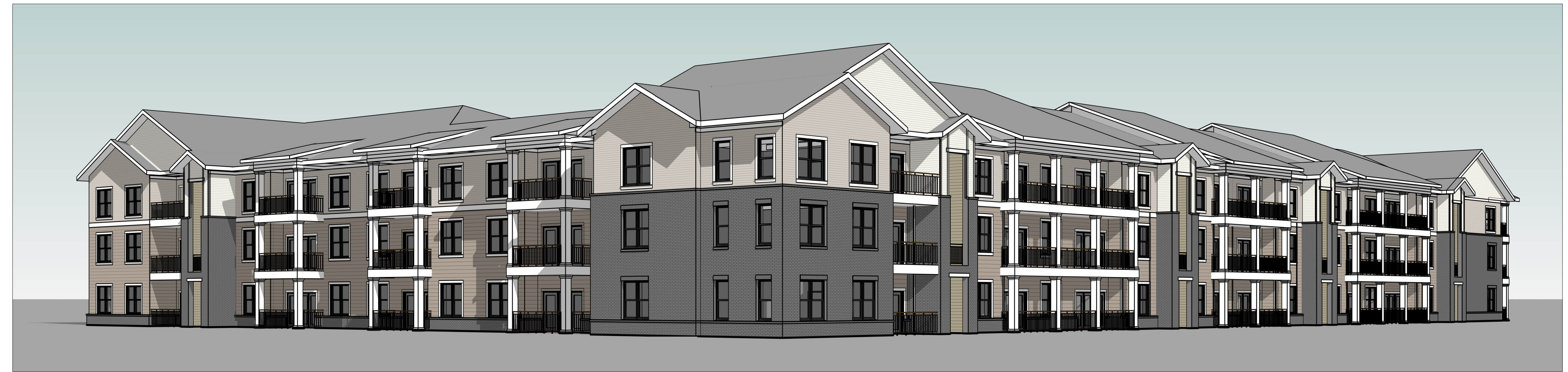
3 3D View 01 SD2.101