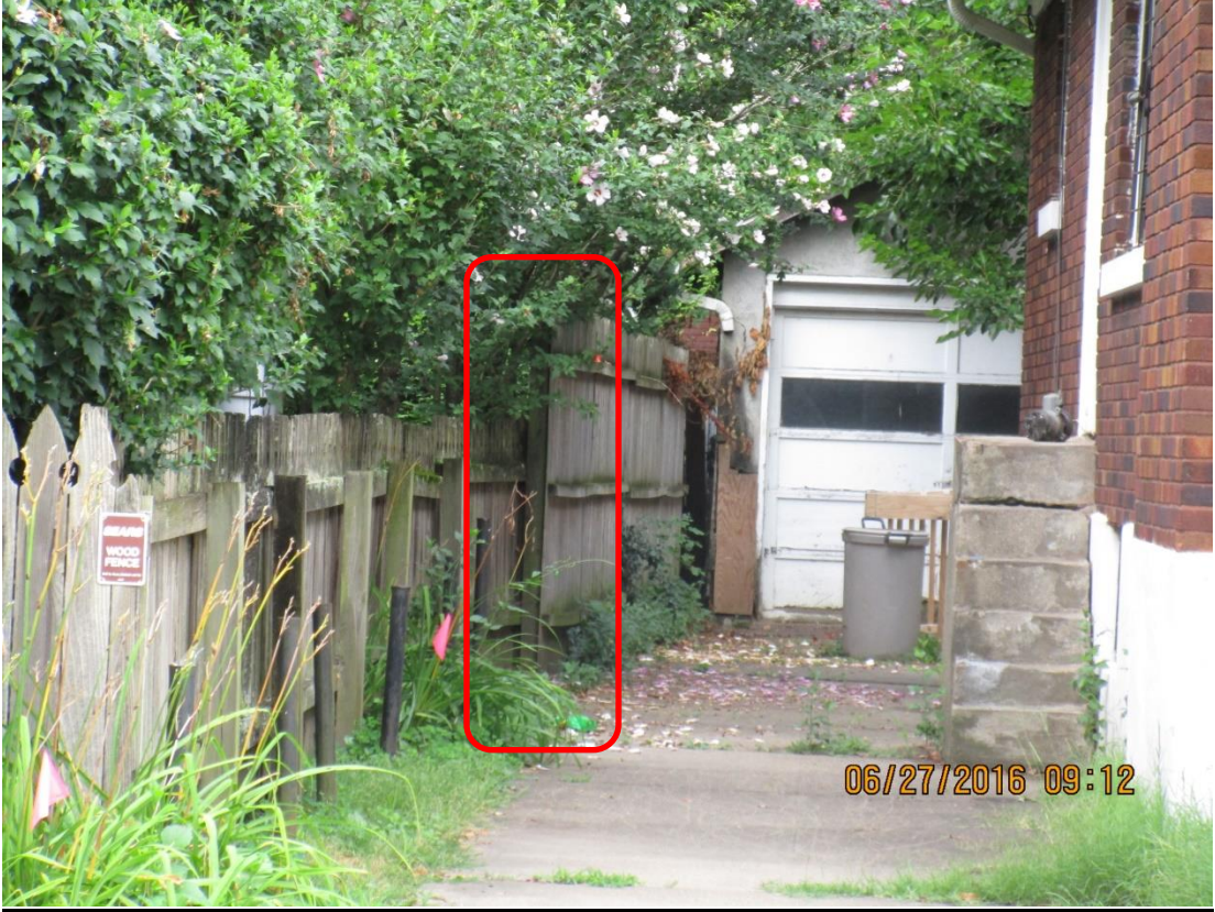
The six foot high wood fence at the rear of the side yard.