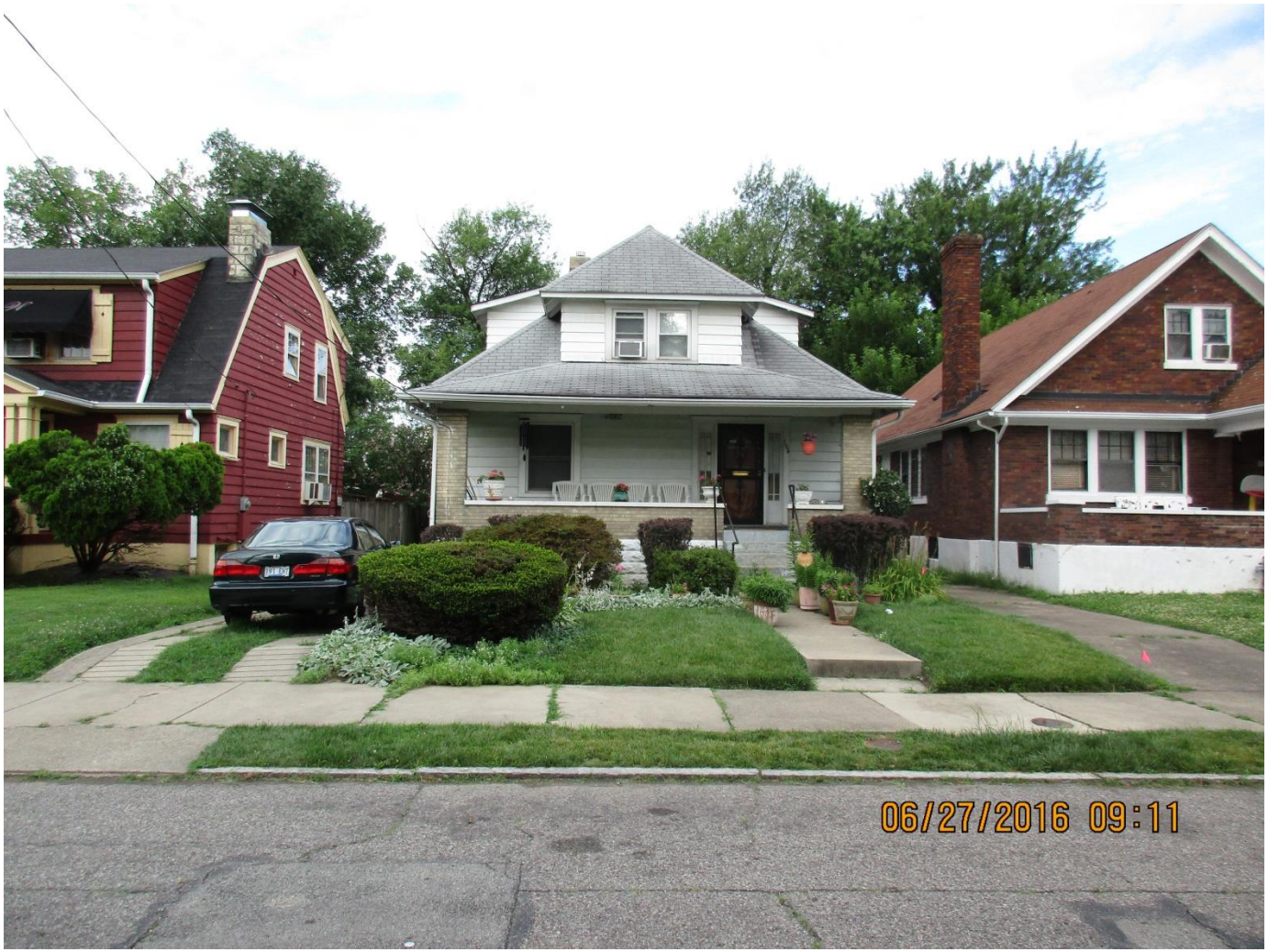
The front of the subject site located at 104 South 36 th Street.