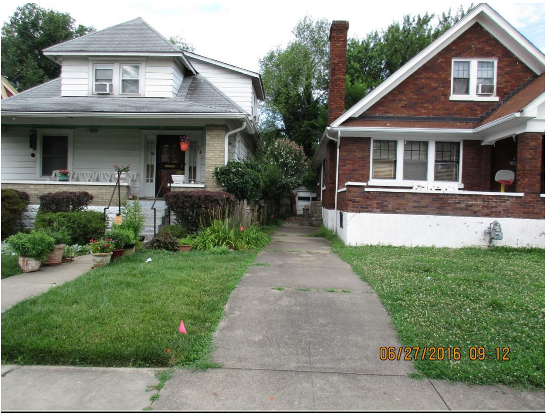
The side yard where the proposed aluminum fence would meet the wood fence along the rear side of home.