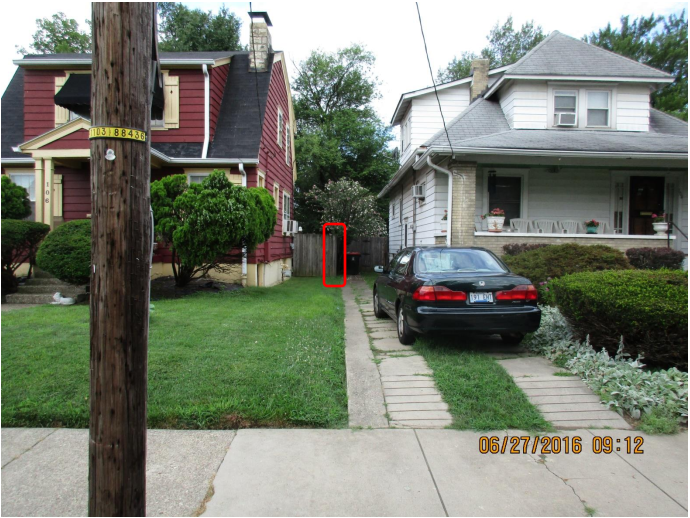
Side Yard area where the proposed fence would meet the wood fence (shown in the red rectangle).