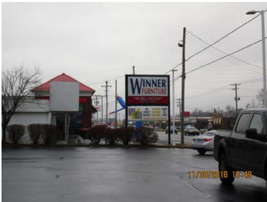
Sign in the area