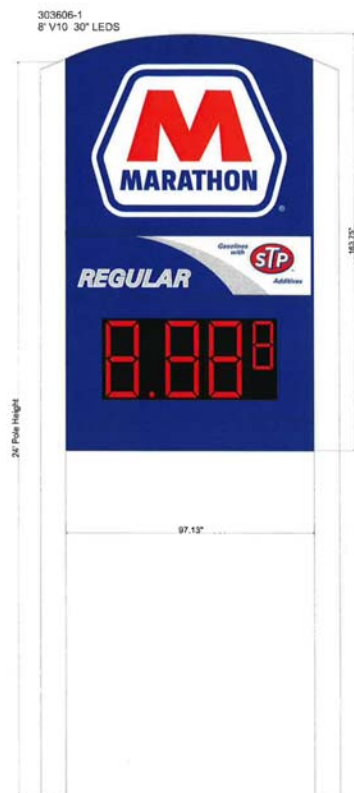
Rendering of proposed sign