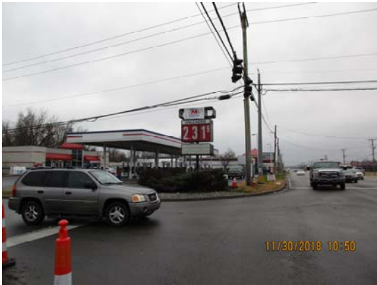
Photo of sign to be replaced and gas station