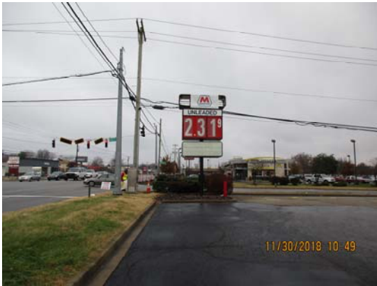
Close up of sign to be replaced