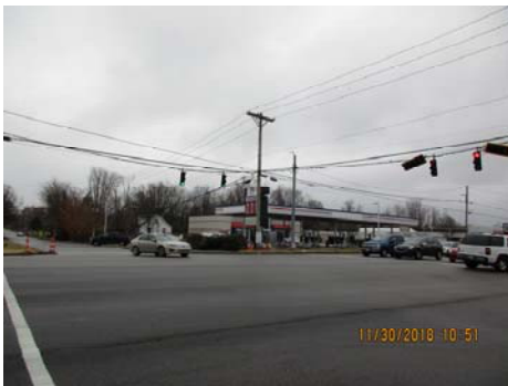
Gas station and existing sign to be replaced