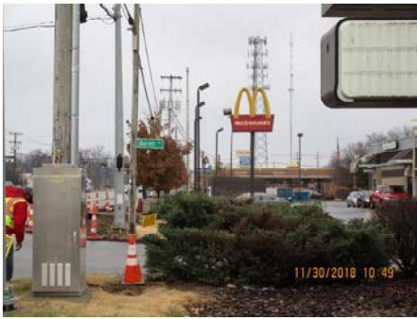
Another sign in the area