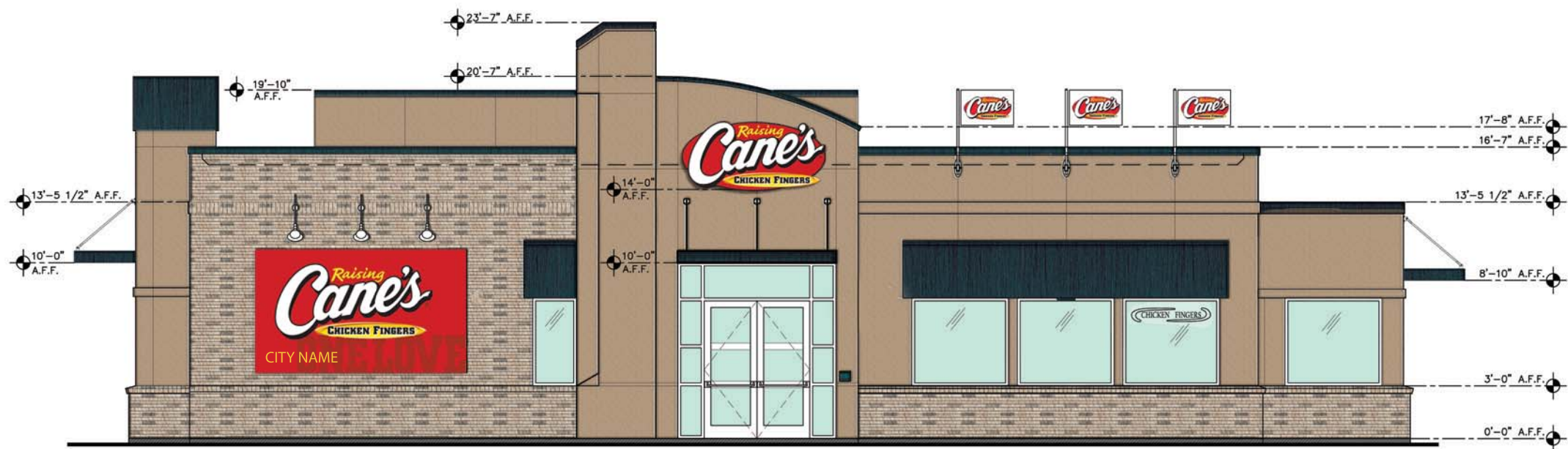
01 FRONT ELEVATION 1/4" = 1'-0" 01: A4.1