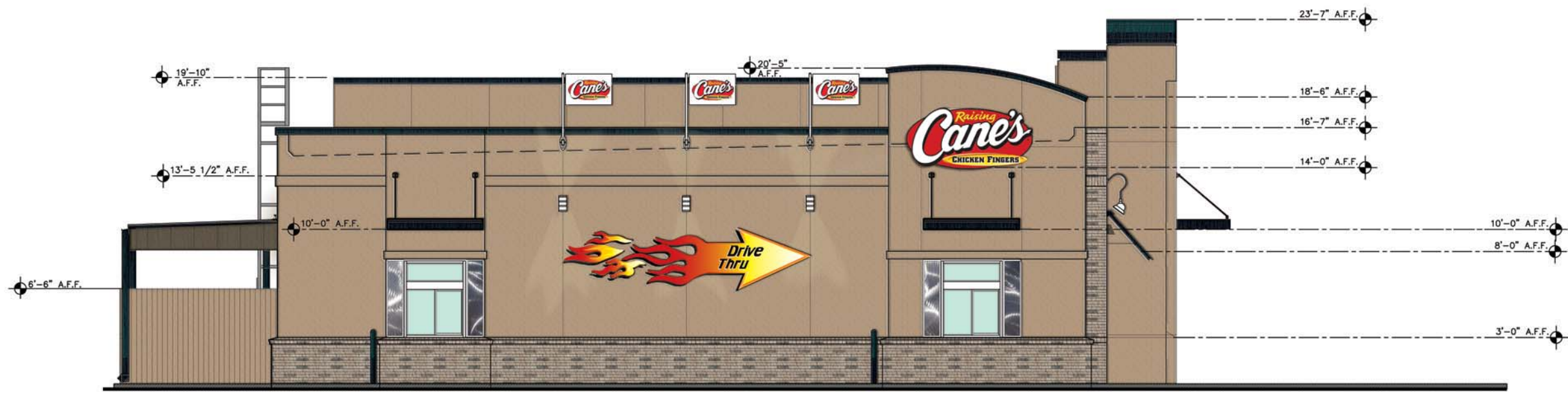
02 DRIVE-THRU ELEVATION 1/4" = 1'-0" 02: A4.1