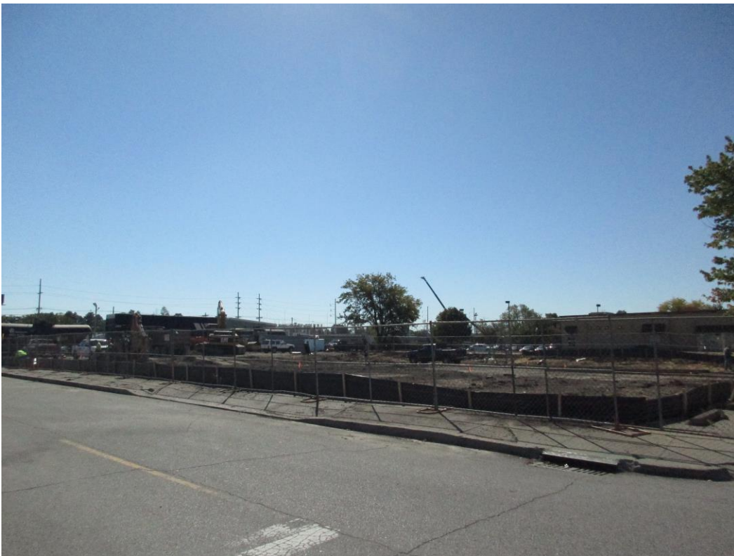
Looking into the Site from East Bloom Street