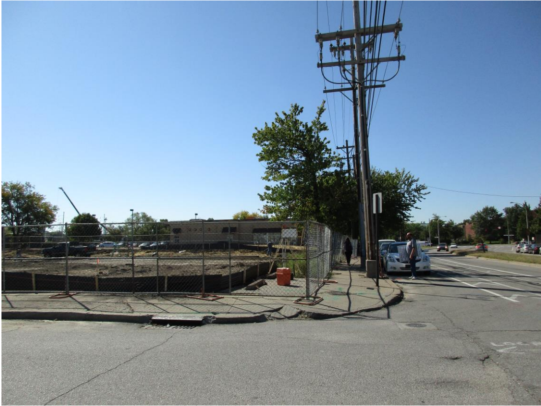
Looking south along South Brook Street