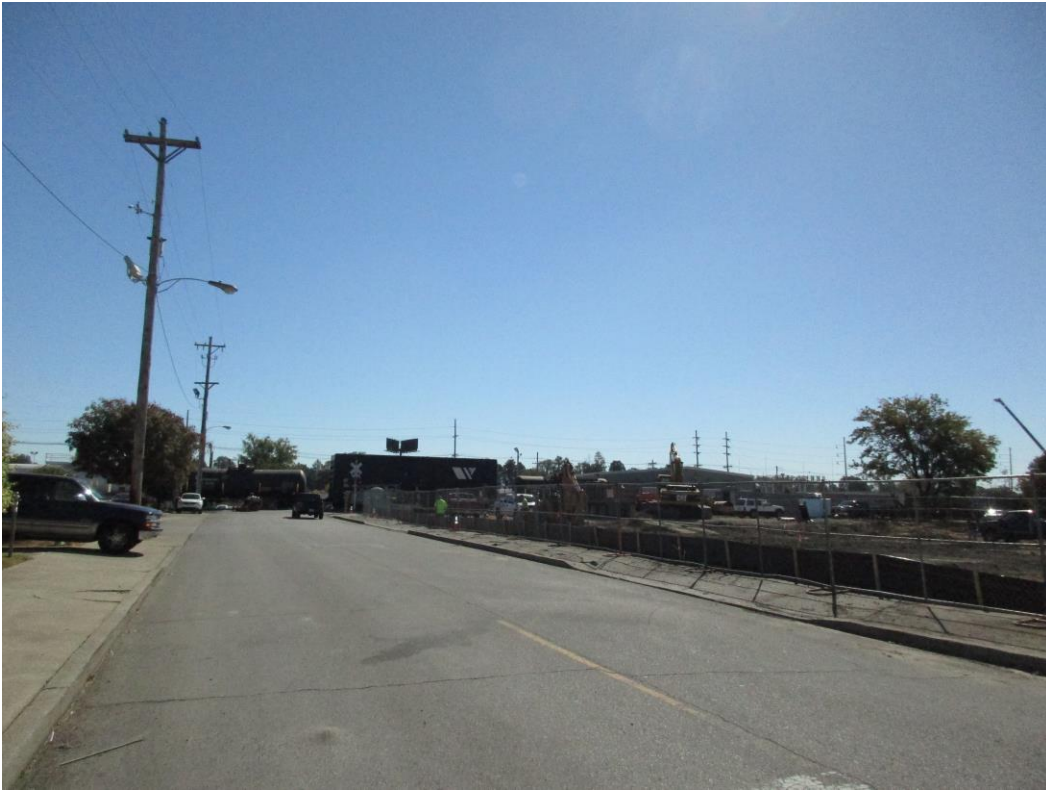
Looking east along East Bloom Street