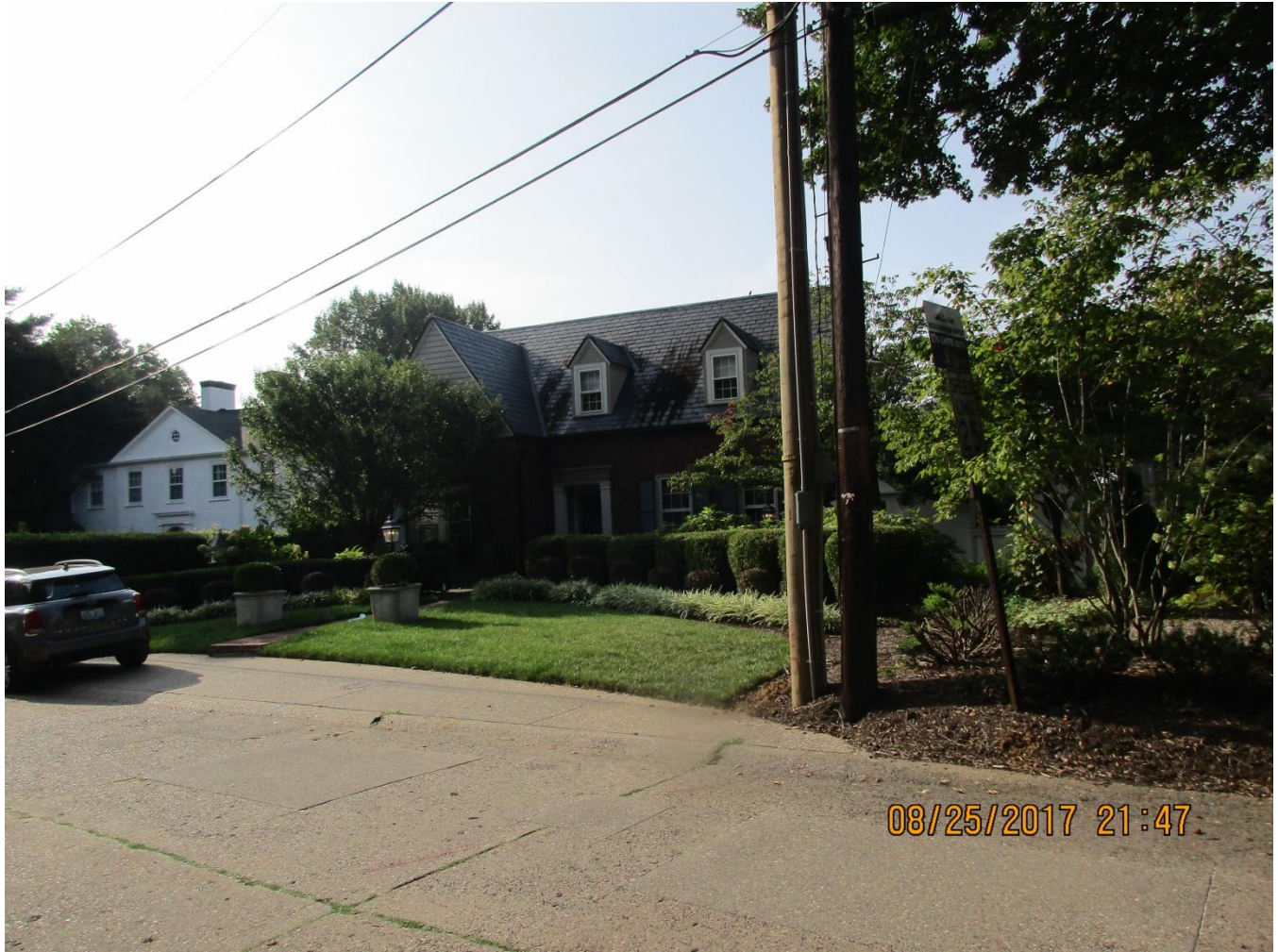
The residence to the left of the subject property.