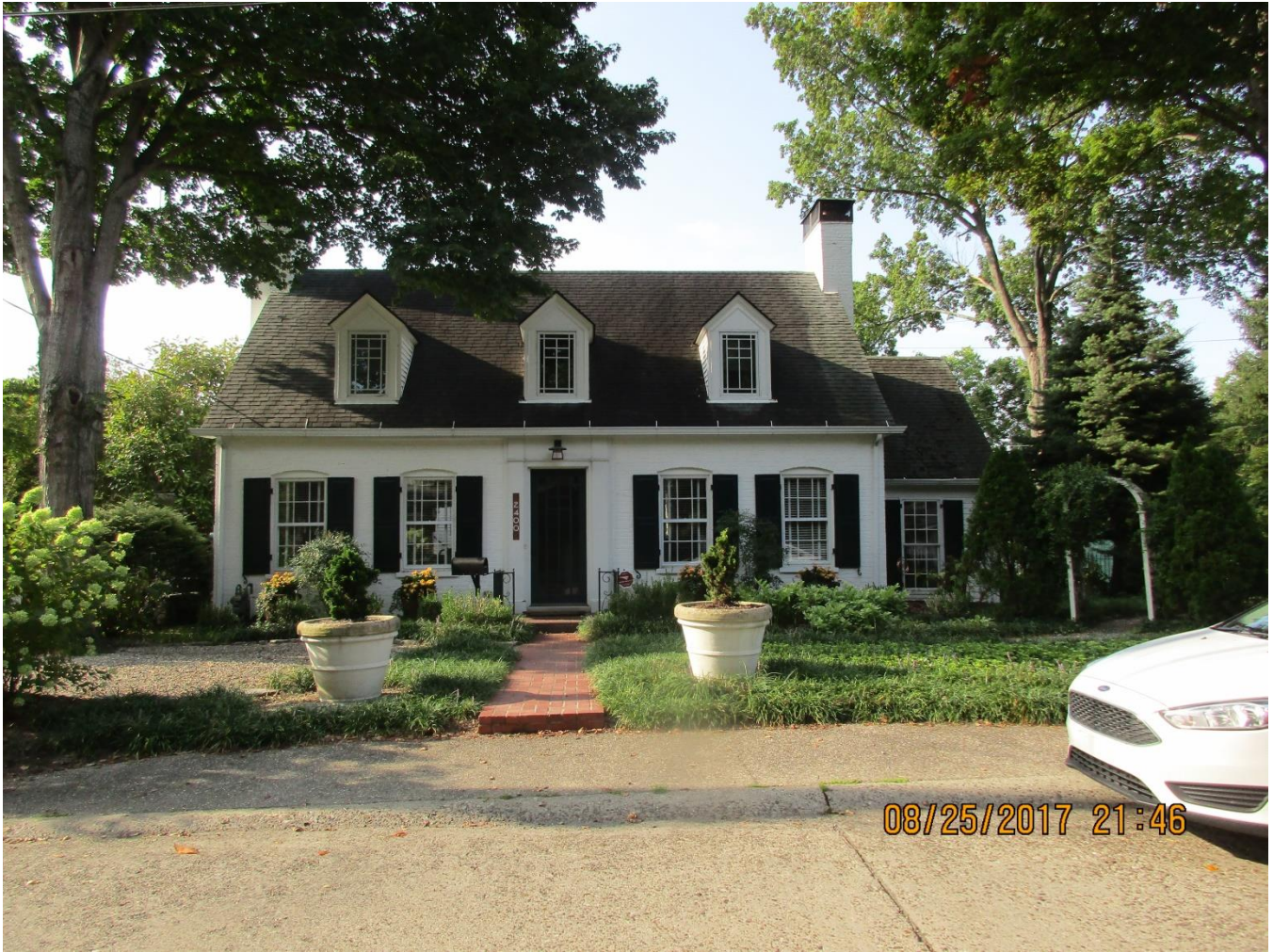
The front of the subject property.