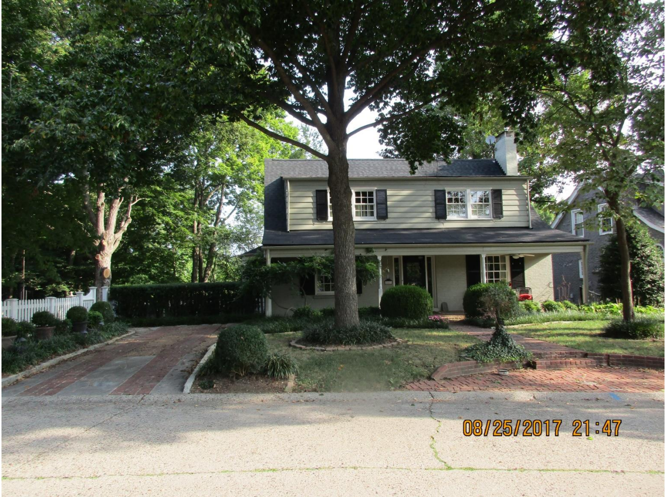
The property across Top Hill Road.