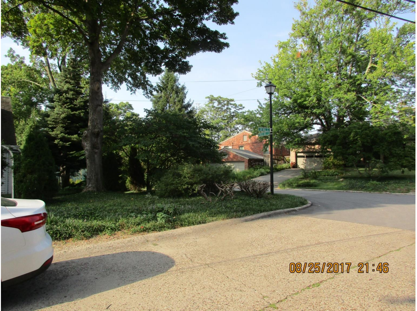
The road to the right of the subject property.