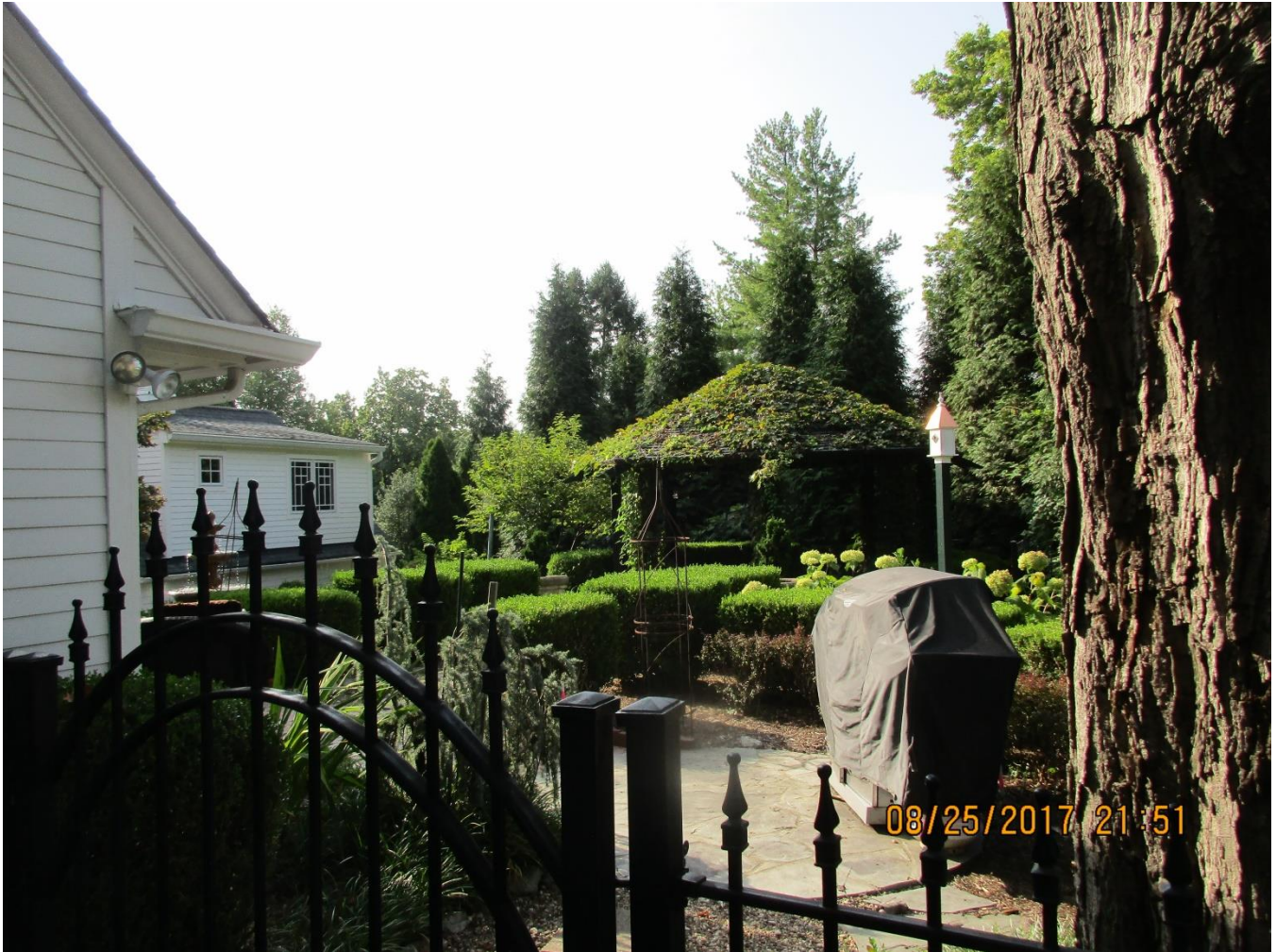
The area where the addition is to be placed. The gazebo is proposed to be removed.