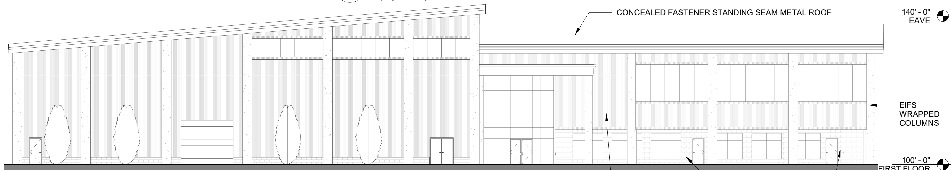
1 CHAMBERLAIN LN. STREET SIDE 1/16" = 1'-0"

CONCEALED FASTENER STANDING SEAM METAL ROOF 140' - 0" EAVE