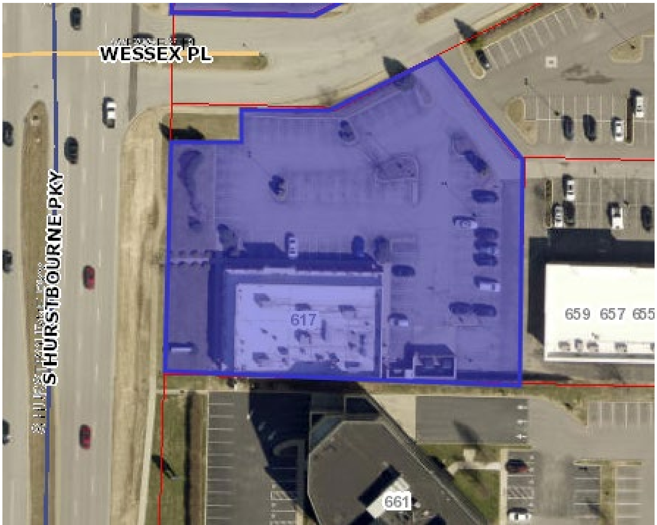
617 S Hurstbourne Pkwy