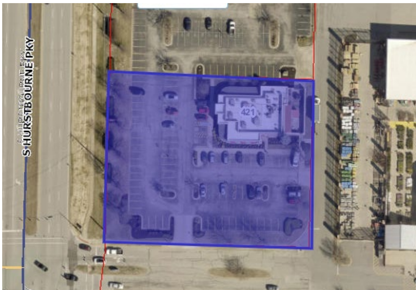
421 S Hurstbourne