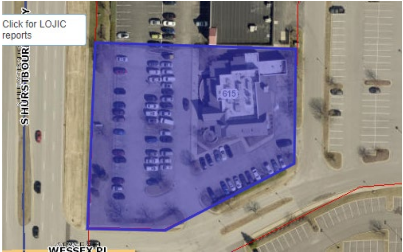
615 S Hurstbourne Pkwy