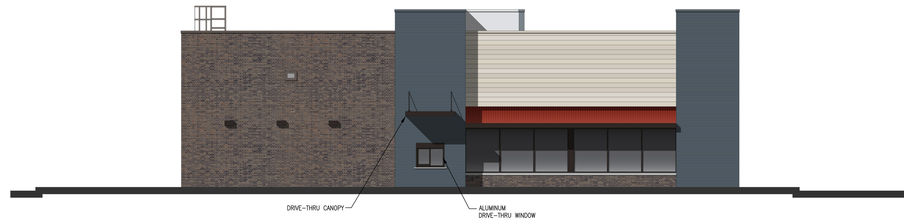
LEFT SIDE (NORTH EAST) ELEVATION