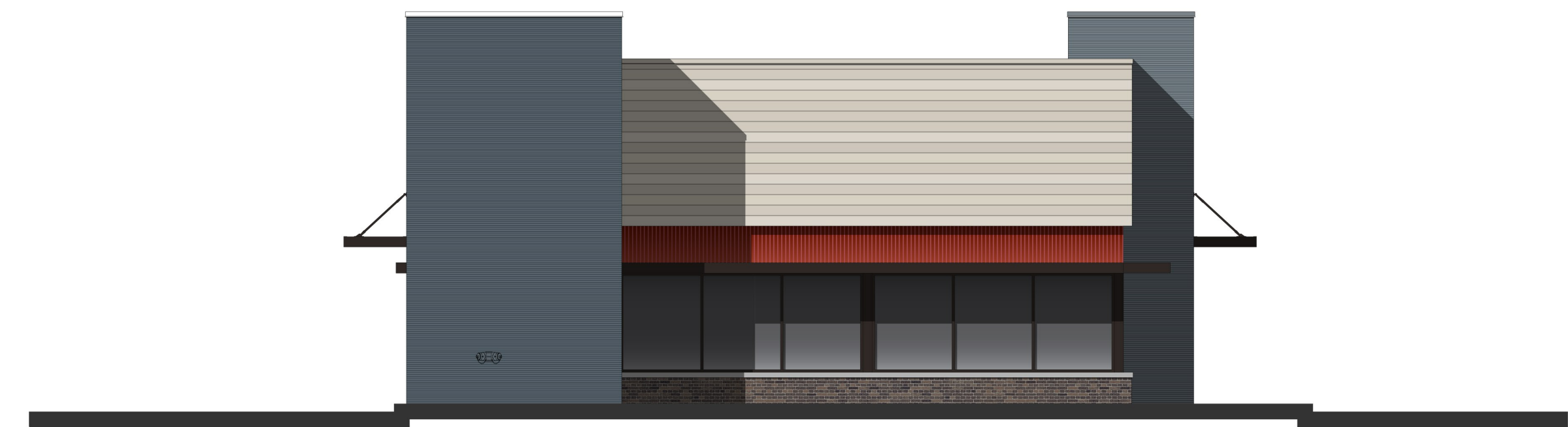
FRONT (NORTH WEST) ELEVATION