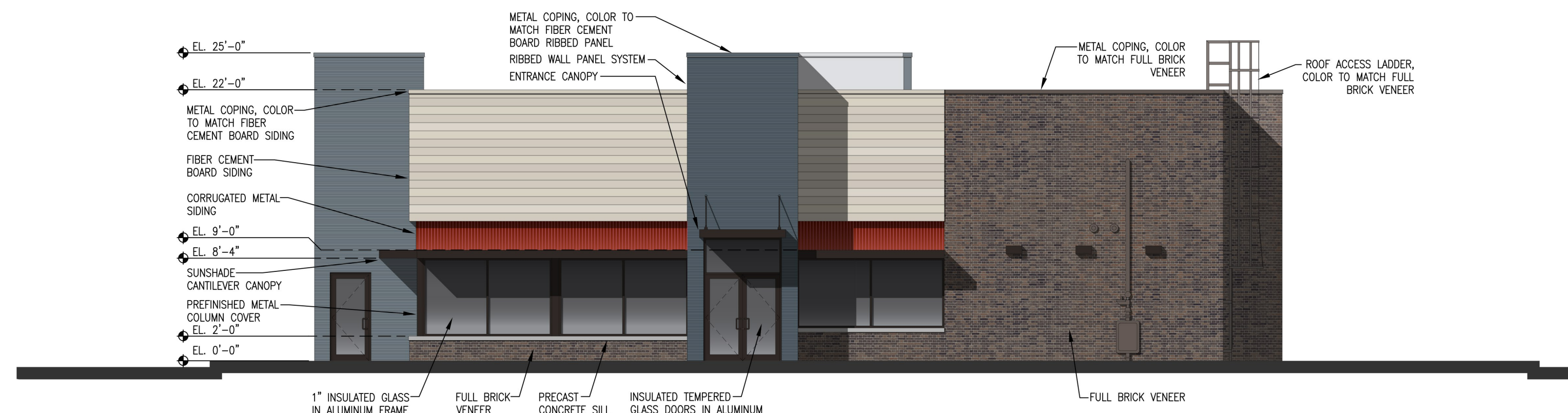
RIGHT SIDE (SOUTH WEST) ELEVATION