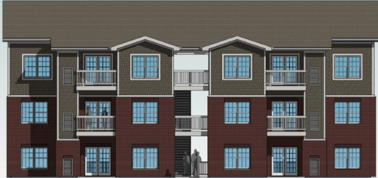
① Front Elevation - 2BR 14 Unit