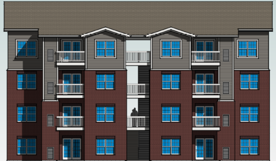
① Rear Elevation - 2BR 14 Unit 1" = 10'-0"