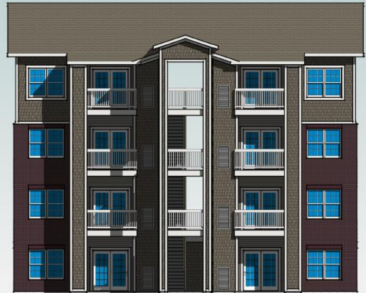
1 1 BR 14 Unit Rear Elevation 1/8" = 1'-0"