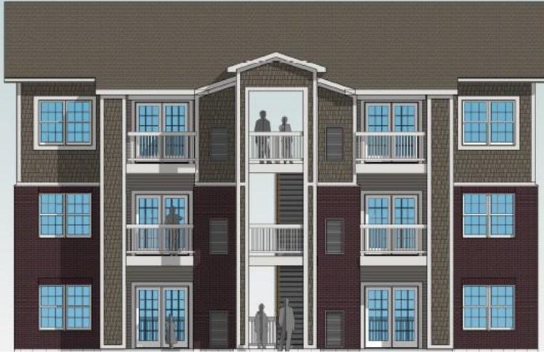
1 1BR 14 Unit Front Elevation