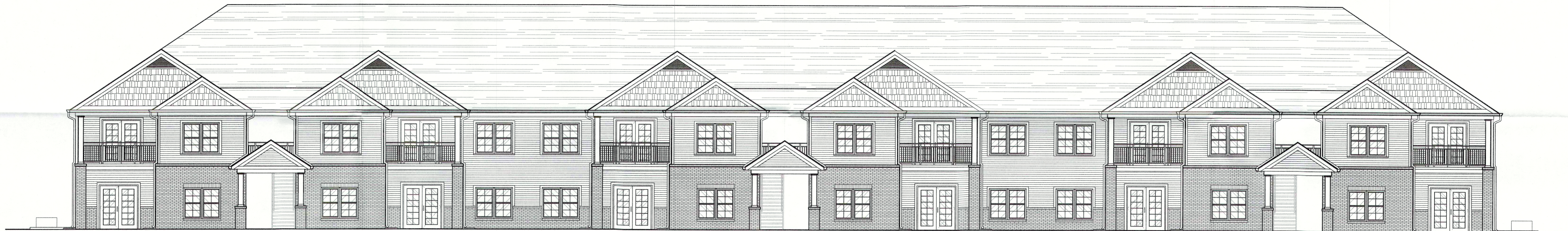
BUILDING TYPE A2 (24-PLEX) FRONT ELEVATION