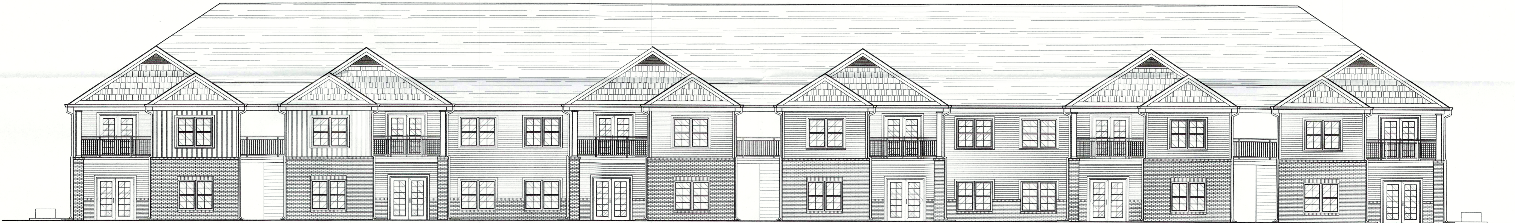
BUILDING TYPE A2 (24-PLEX) FRONT ELEVATION