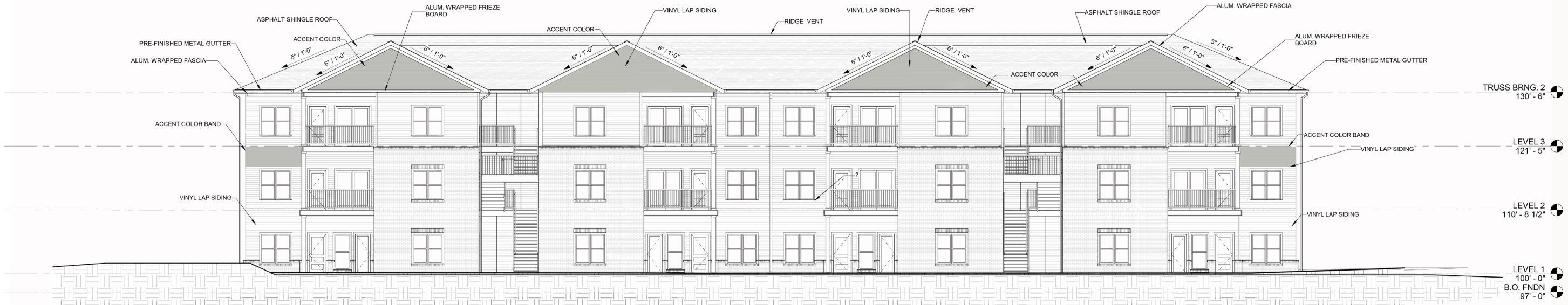
1 BUILDING ELEVATION 1/8" = 1'-0"