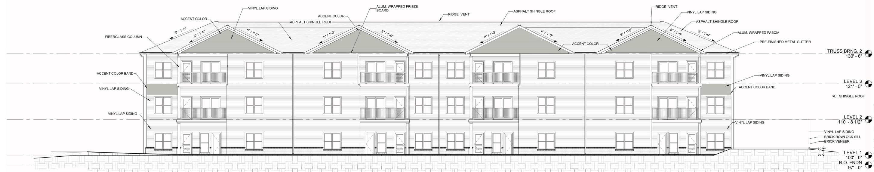
4 BUILDING ELEVATION 1/8" = 1'-0"