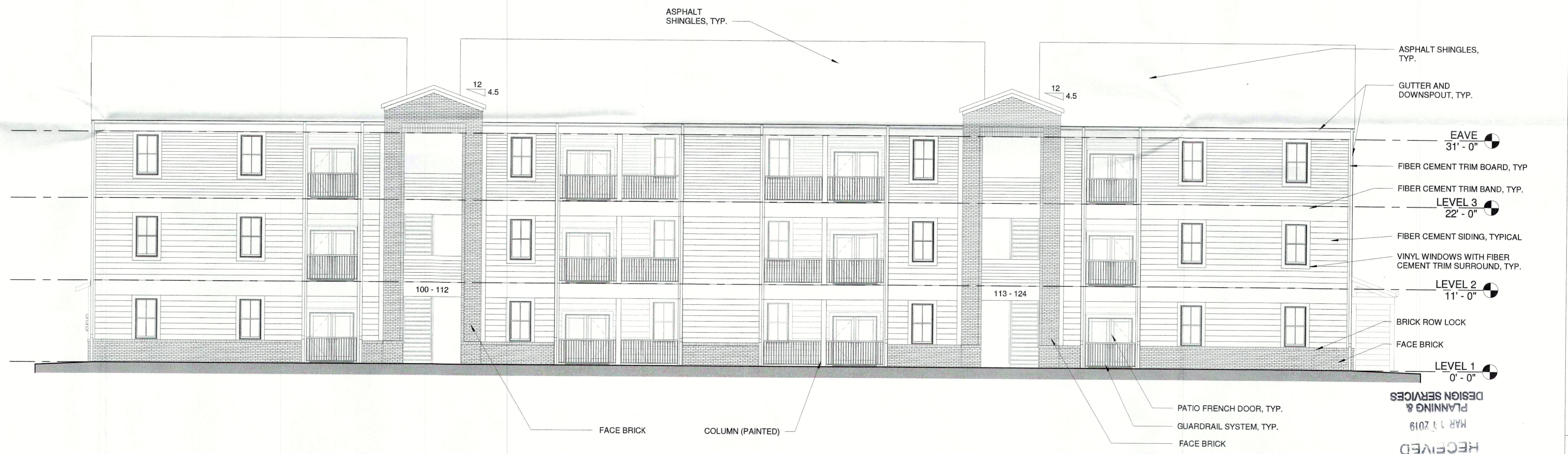
FRONT ELEVATION BUILDING A 2 1/8" = 1'-0" A400