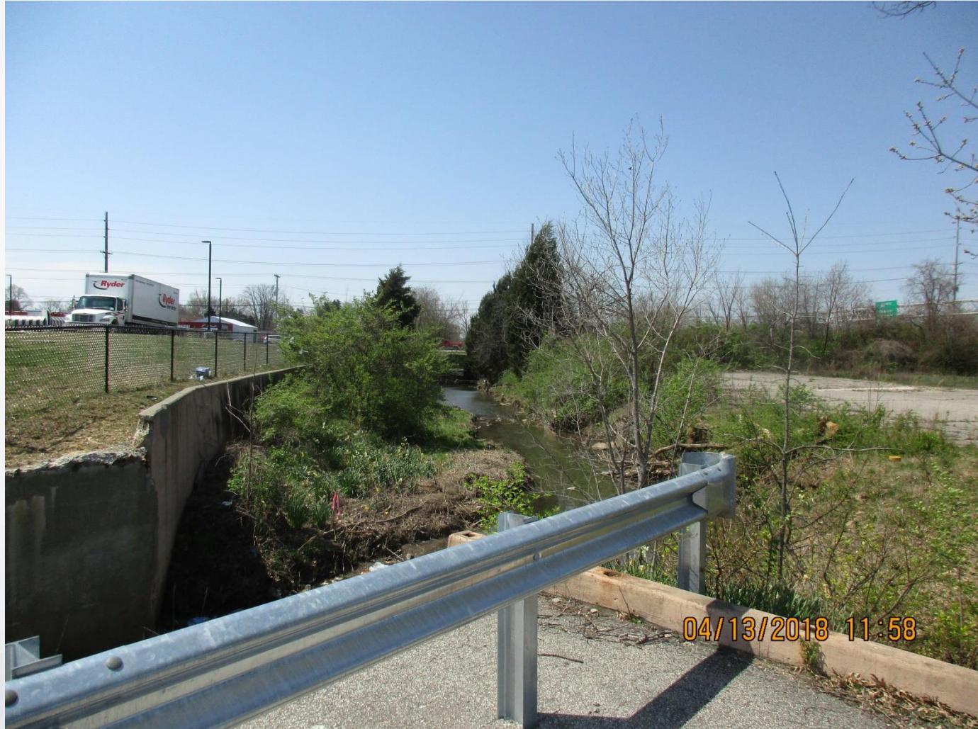
Looking southwest, towards Bardstown Rd., the Intermittent Stream is shown.