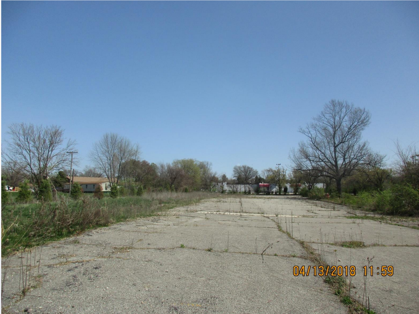
Looking east, towards the vacant AMF Bowling Alley.