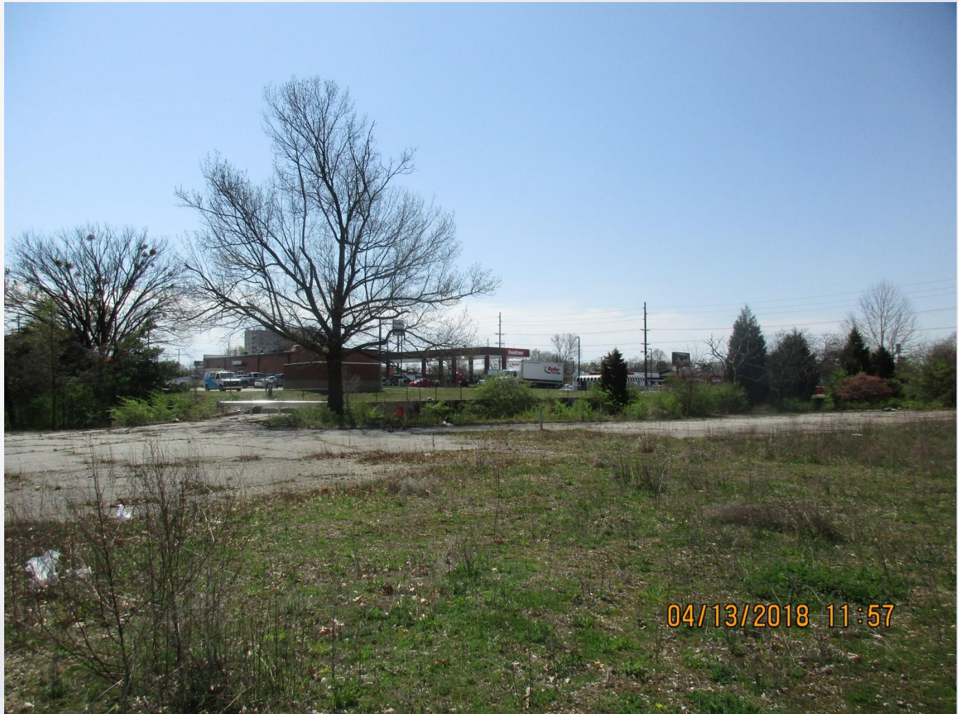
Looking southwest towards Tract 2-1, Thornton's Gas Station, from the subject site.