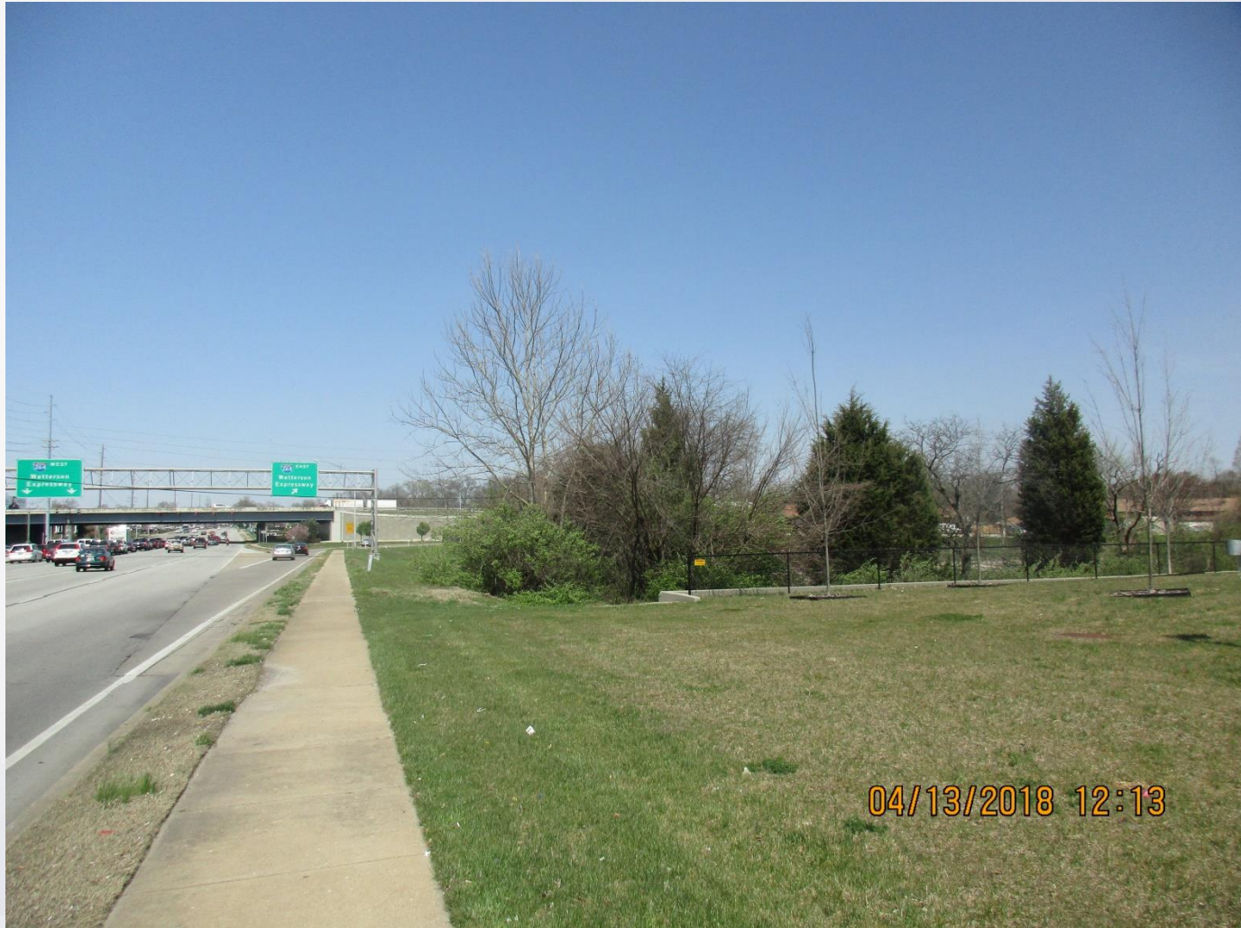
Looking along the frontage of the subject site north along Bardstown Rd./Interstate East On-ramp .