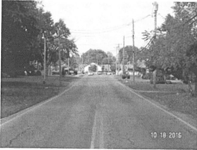
Begin Project – Blanton Lane @ Dixie Highway