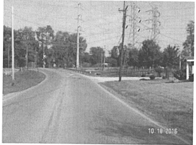
R/R Crossing (west of Mills Drive)