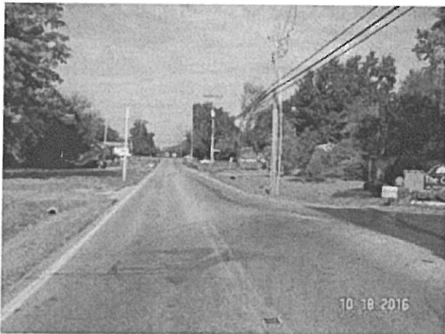
Existing Road between Rosemary Lane & Brooklawn Drive