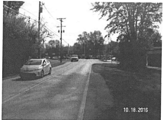
End Project – Blanton Lane @ St. Andrews Church Road