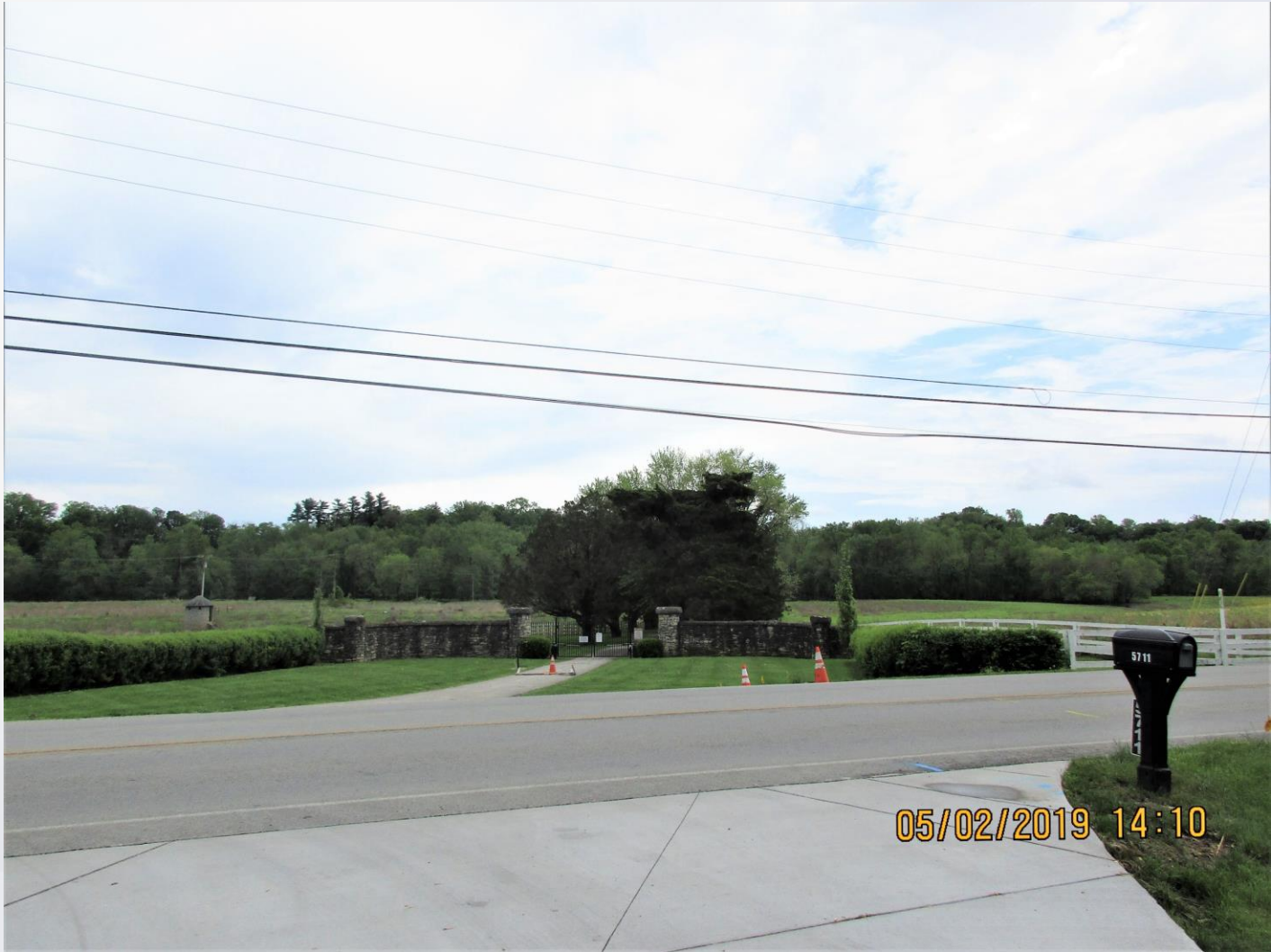
Across to East