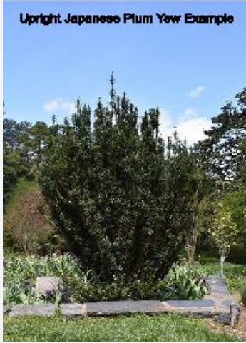
Upright Japanese Plum Yew Example

(5) Upright Japanese Plum Yew to screen getting installed Growth rate of 8" - 8" per year. Will grow to be about 10 feet tall at maturity, with a spread of 6 feet. It has a low canopy with a typical clearance of 1 foot from the ground