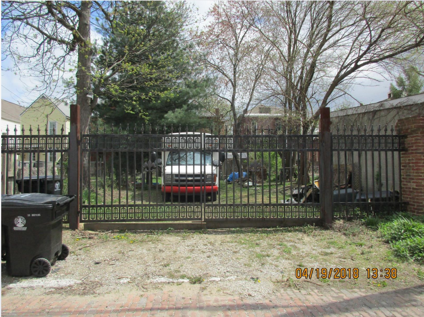
Rear Alley Access