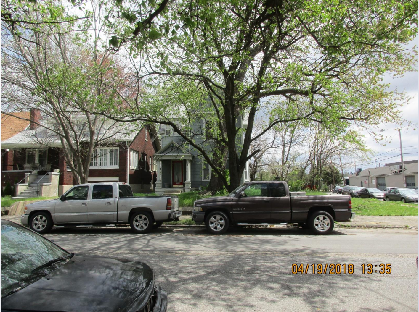
Adjacent to East