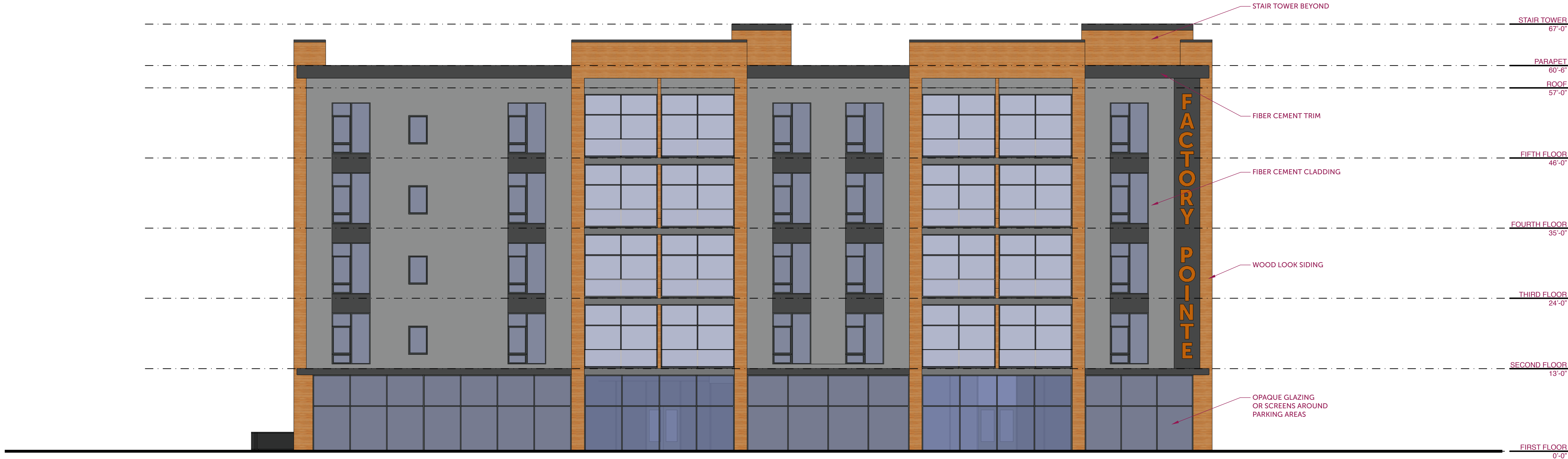
2 NORTH ELEVATION SCALE :: 1/8" = 1'-0"