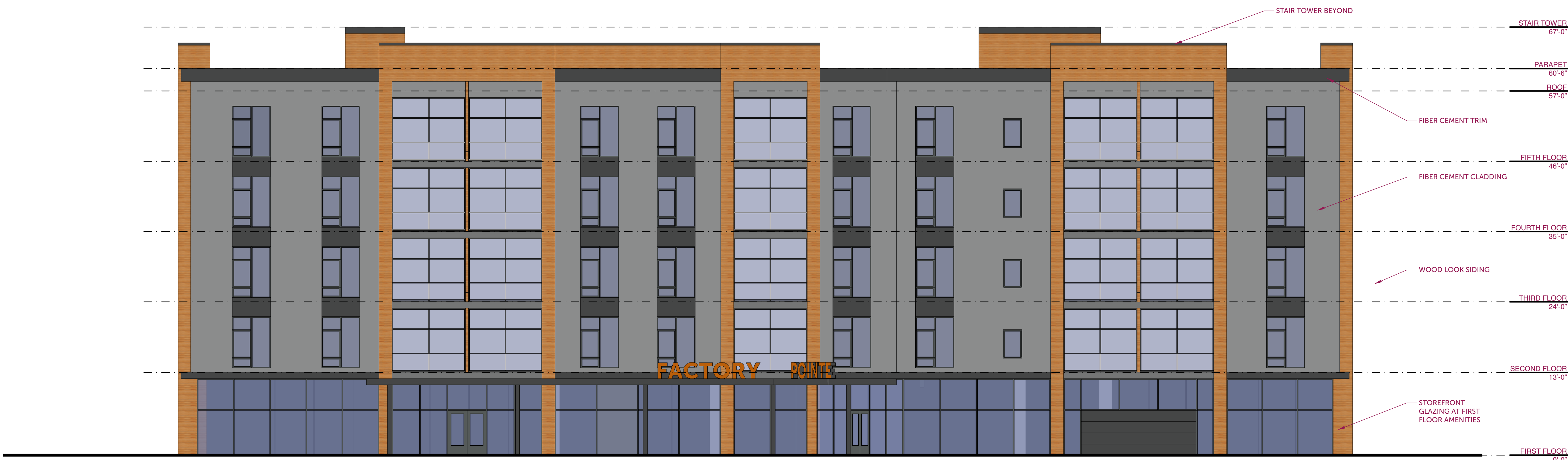
1 EAST ELEVATION SCALE :: 1/8" = 1'-0"