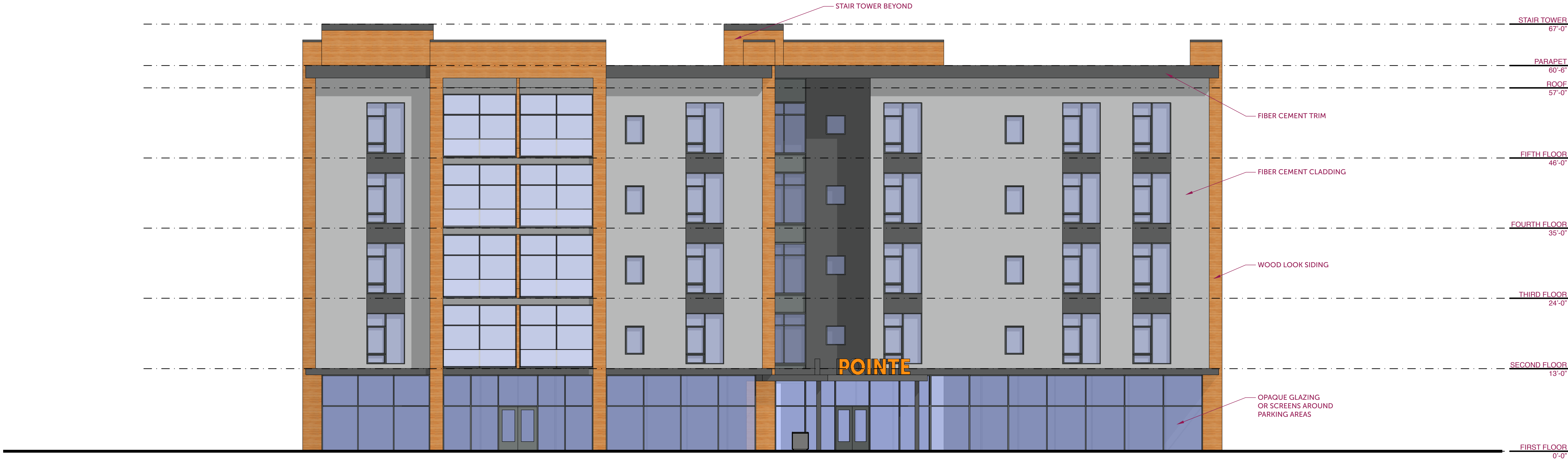
2 SOUTH ELEVATION SCALE :: 1/8" = 1'-0"