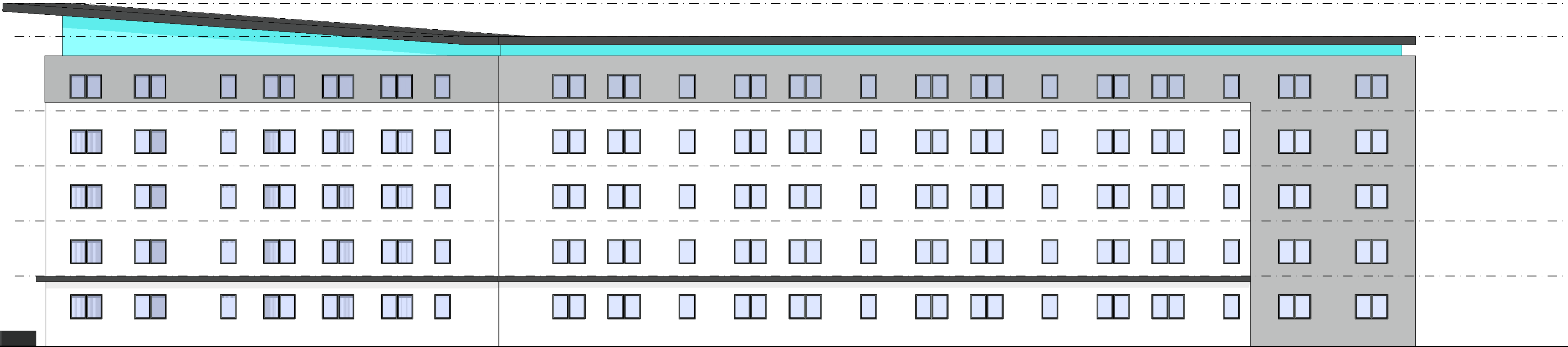
2 | SOUTHWEST ELEVATION