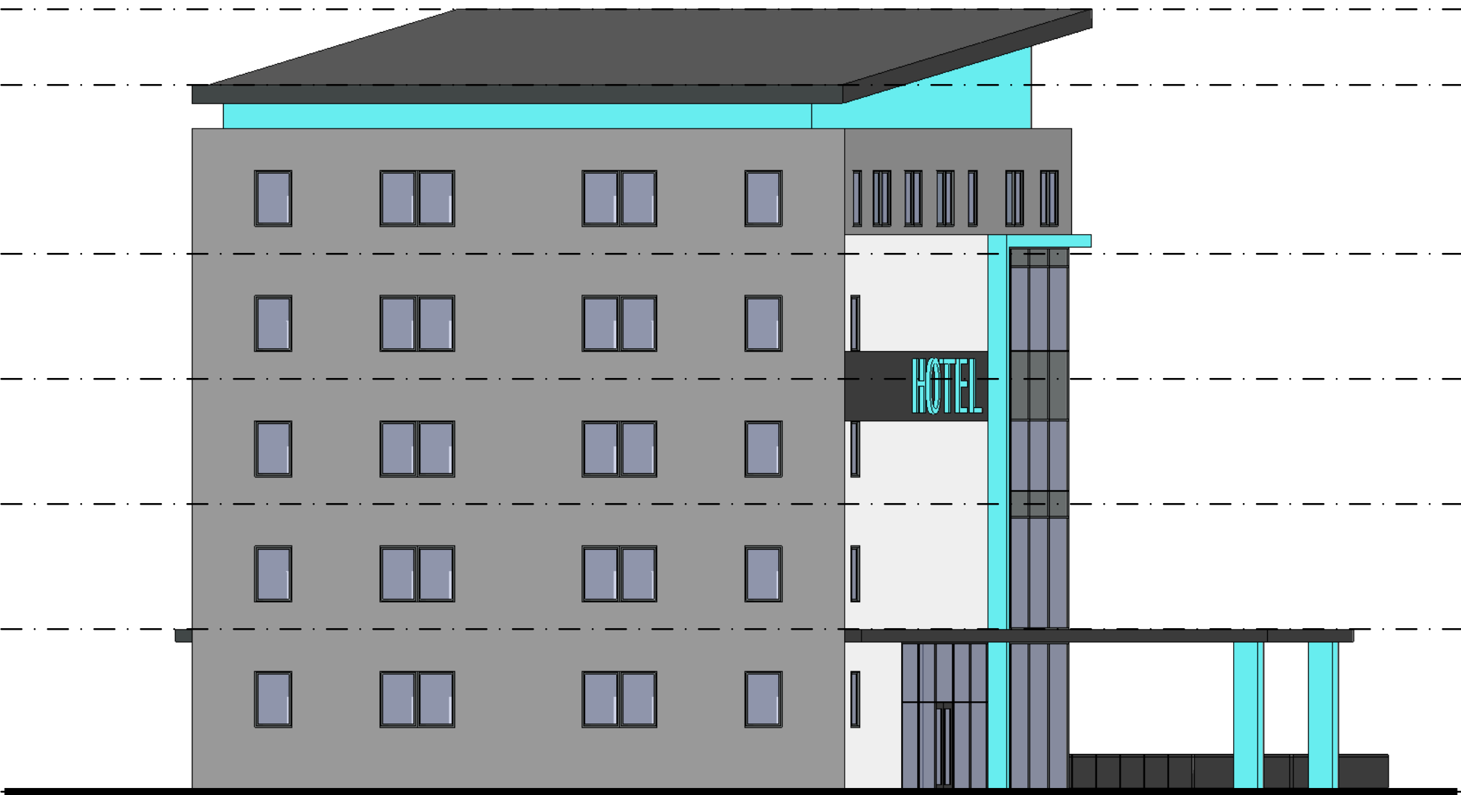
4 | SOUTHEAST ELEVATION