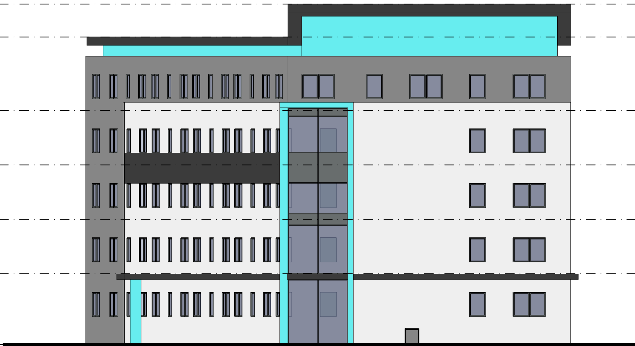
3 | NORTHWEST ELEVATION