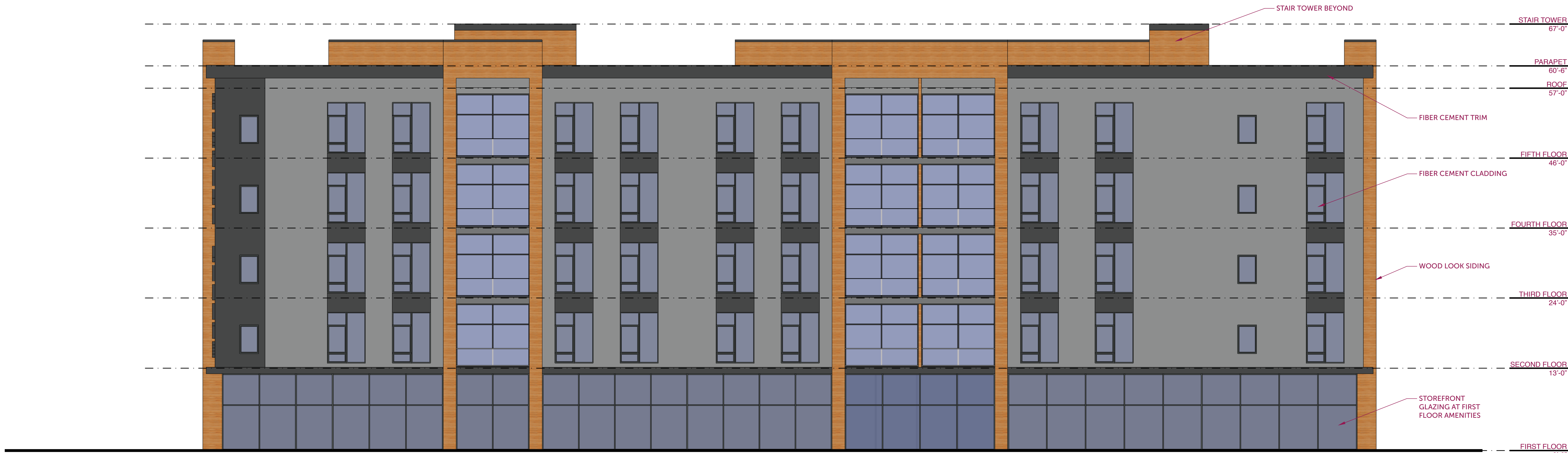
1 WEST ELEVATION SCALE :: 1/8" = 1'-0"

Factory Pointe Kendall Cogan 13000 Factory Lane Louisville, KY 40245