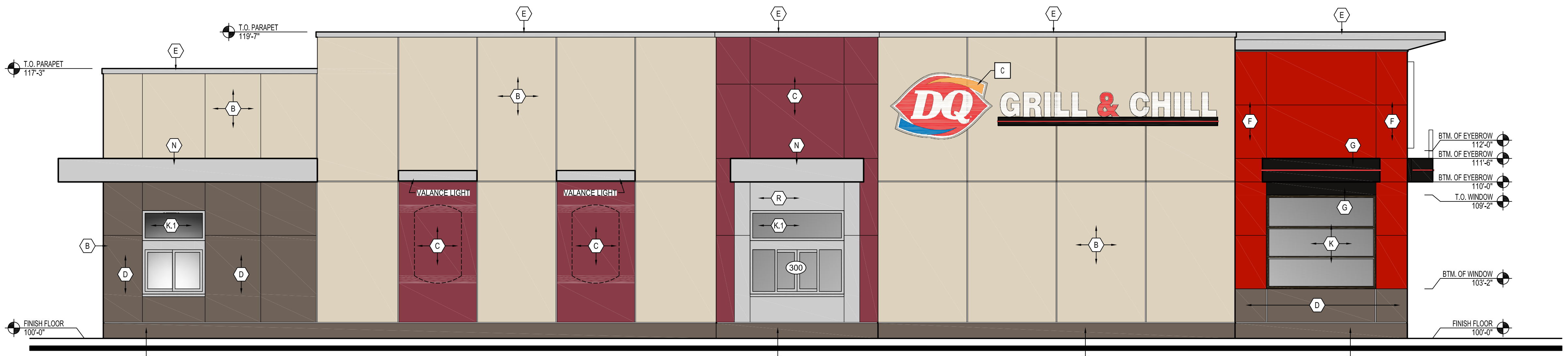
4 DRIVE-THRU ELEVATION A3.1 SCALE: 1/4" = 1'-0"

NEW BUILDING FOR: DQ GRILL & CHILL 5103 OUTER LOOP LOUISVILLE, KY 40219