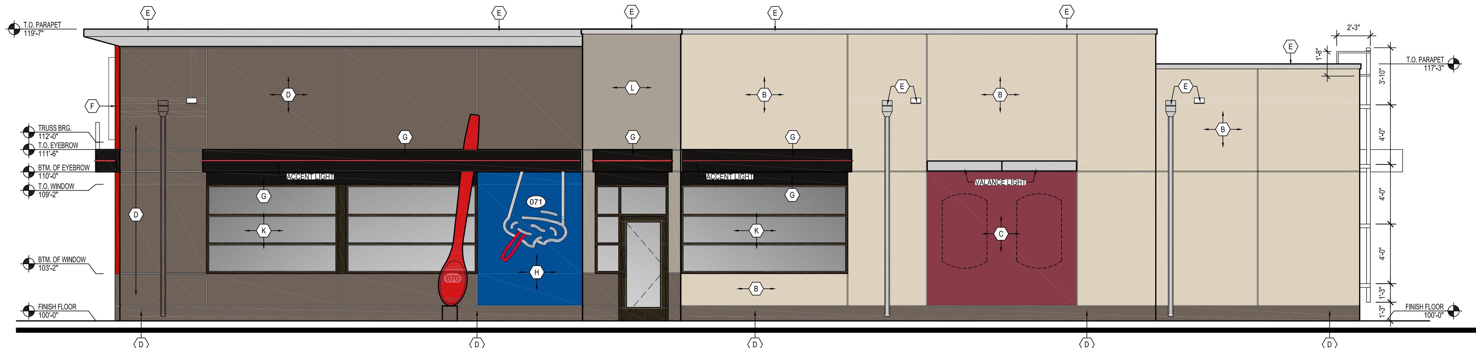
3 ENTRANCE ELEVATION A3.1 SCALE: 1/4" = 1'-0"

NOTE: THE DQ RED SPOON HANDLES HAVE SPECIAL INSTALLATION REQUIREMENTS. ALUM. STOREFRONT MFG. MUST COORD. LOCK & HANDLE, LOCATION & HEIGHTS